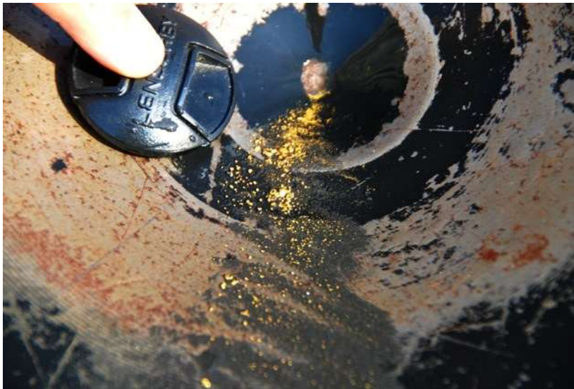
Figure 4. Free gold from a hand crushed sample of Cascavel material.

During the second half of 2014, Orinoco announced that it has materially increased the size of the Cascavel Gold Project after securing a highly prospective nearby tenement with known gold mineralization ( the Garimpo target ).