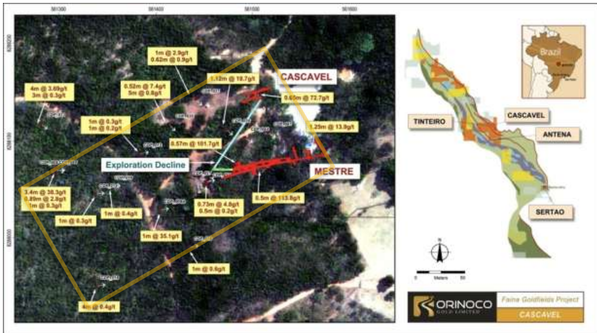
Figure 1. Showing a plan view of the initial area of underground mining in the Cascavel area.

The evidence for mineralisation in and around the Cascavel area gives the Company great confidence that it can rapidly grow the potential of the Faina Goldfields Project.