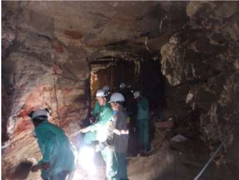
Figure 3. Cleaning the face of the exploration decline ahead of sampling.