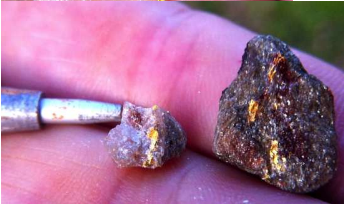
Figures 2a and 2b – Show coarse visible gold up to 5mm strongly elongated parallel to the stretching lineation.