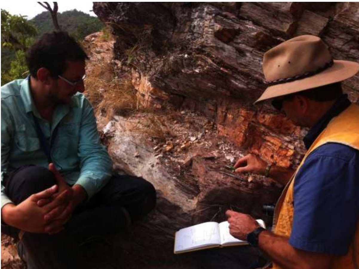
Figure 5- Outcropping mineralised zone at the Garimpo target, 1.5kms from Cascavel

The new tenement will now become an Exploration Application prior to being gazetted as an Exploration Lease. No payment for the tenement (other than the usual Department of Mines annual fees) is required and the Exploration Lease will form part of Orinoco's 70:30 partnership at Cascavel.