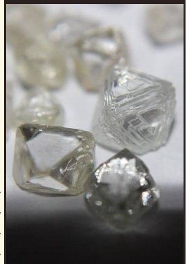
Photograph of diamonds recovered from the processing of bulk samples from Newfield’s Allotropes Diamond Project in Sierra Leone.