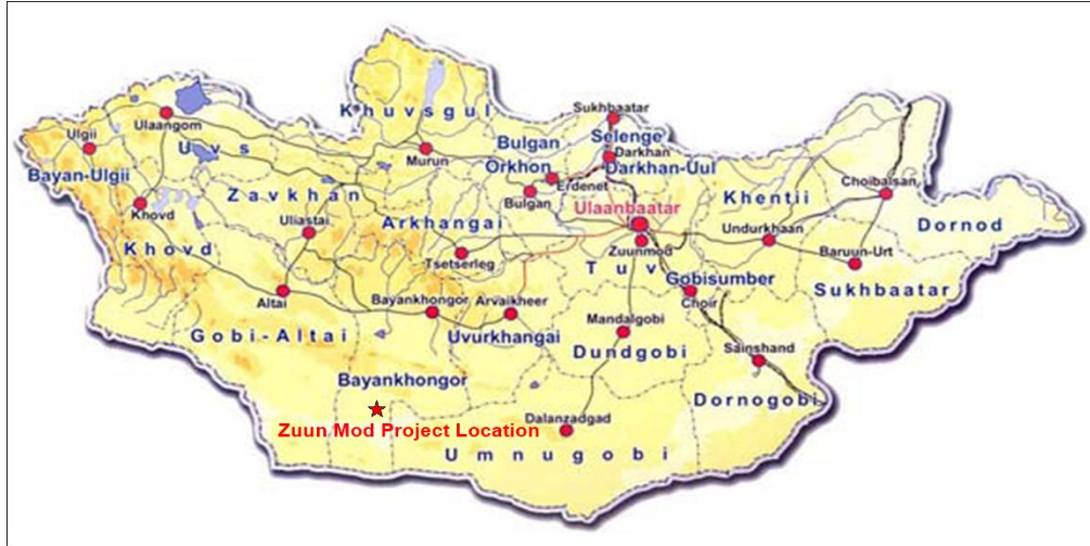
Figure 1: Locality Map of Zuun Mod Project

The Zuun Mod project is located in the south west of Mongolia, 950 km to the south west of Ulaanbaatar and 180km north of the China/Mongolia border, in the Gobi Desert. The local province or state is Bayankhongor Aimag, with its regional center, the city of Bayankhongor, 340 km to the north of Zuun Mod.