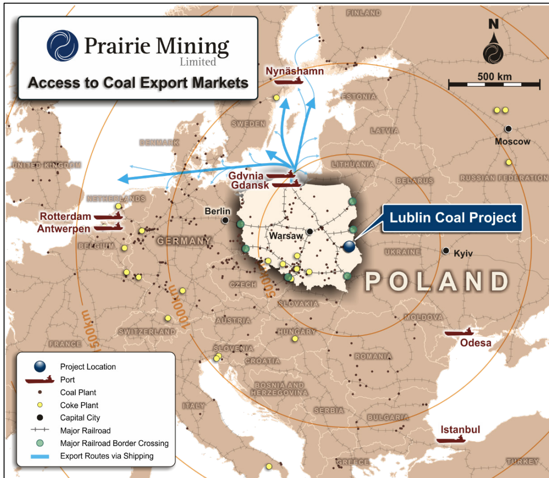
Figure 1: LCP Target Export Locations