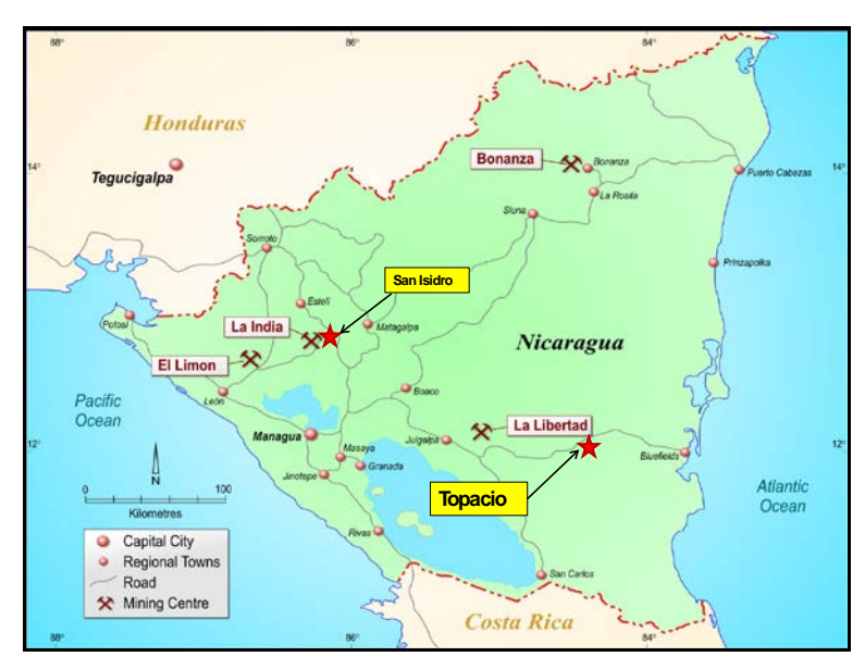
Figure 1 Major Nicaraguan gold deposits and the Topacio Gold Project (Central America)

Work programs have been agreed for the Minimum Commitment phase, with planning now well underway. While initial preparation will commence immediately, activities are scheduled to accelerate at the commencement of 2016.