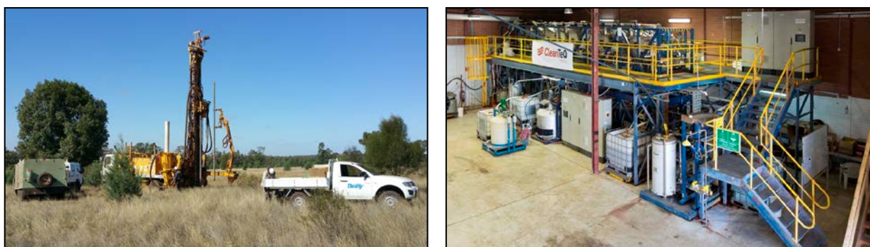
Figure 2: Drill rig on site at Syerston and Clean TeQ's Demonstration Plant in Perth, Australia

Subsequent to completion of the Scoping Study in May 2015, Clean TeQ has completed two drilling programs 3 to better define the high grade scandium zones on the Syerston deposit. Additionally, significant metallurgical test work and a large scale demonstration 4 program of works have been completed on Syerston ore to confirm the process parameters for the project.