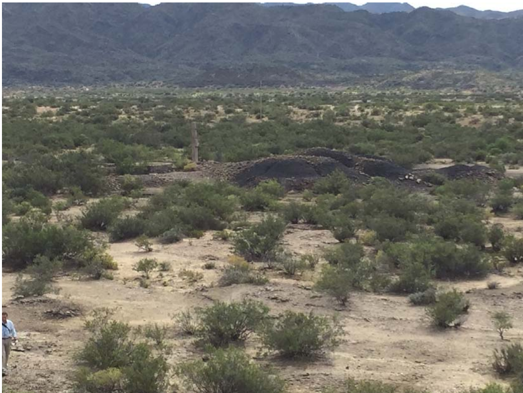
Figure 4: Rodolfo historical shaft, mine workings and waste dumps.