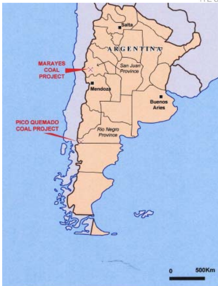
Figure 1: Location of Marayes and Pico Quemada Projects, Argentina