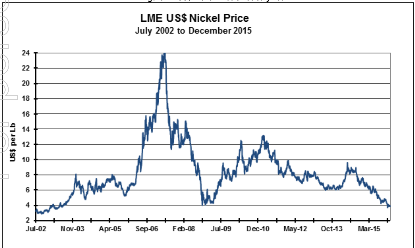
Figure 1 – US$ Nickel Price since July 2002

The continuing decline in the US$ nickel price to levels not anticipated by the Company or the market in general ( Figure 1 ) and the uncertain outlook for the nickel price (and copper and cobalt) over the foreseeable future has necessitated a review of activities at Savannah and in the Perth Office.