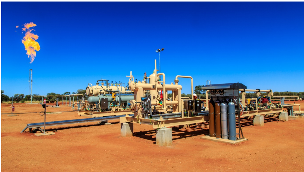
Figure 6: Brewer Estate City Gate Gas Plant being commissioned in March 2015