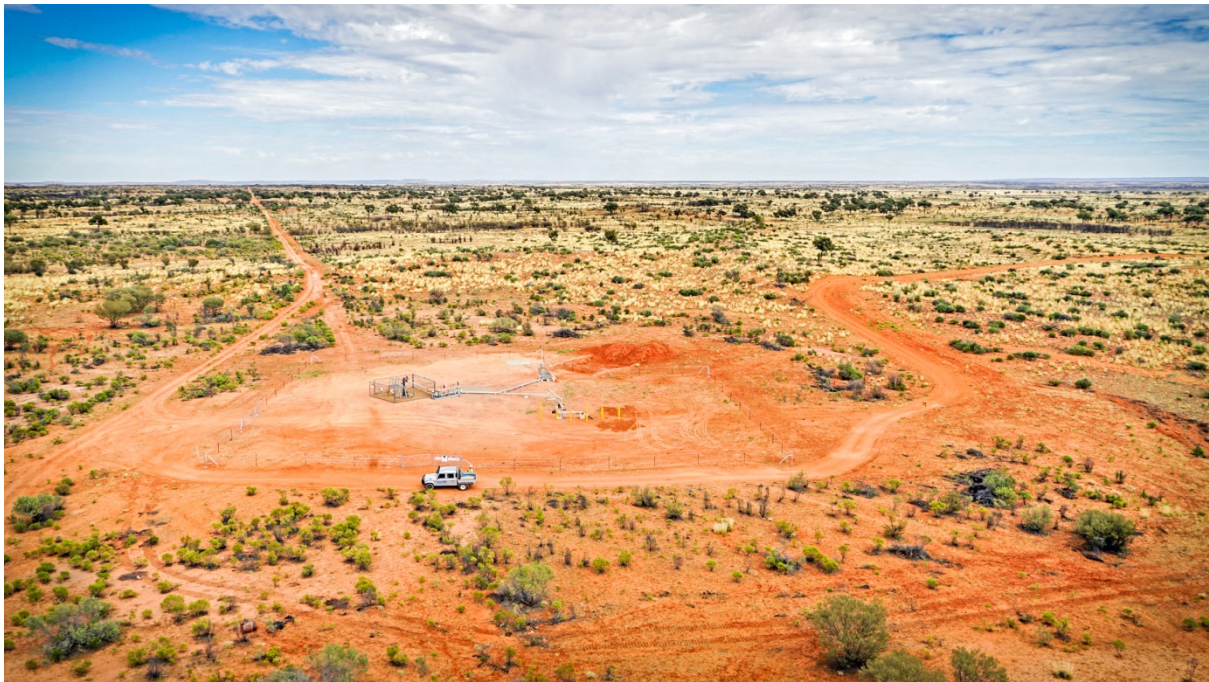
Dingo Well 2 – Surface Facilities