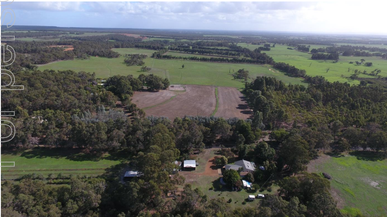
Figure 2. Location of Busselton agricultural property, site of first CellCube battery installation in WA.

“Working with Sun Connect and Western Power, we will bed down the installation and connection of the PV system and the CellCube to the grid. We will use our new knowledge to highlight the benefits that large flow battery systems can offer commercial customers, as well as the utilities, throughout Australia.”