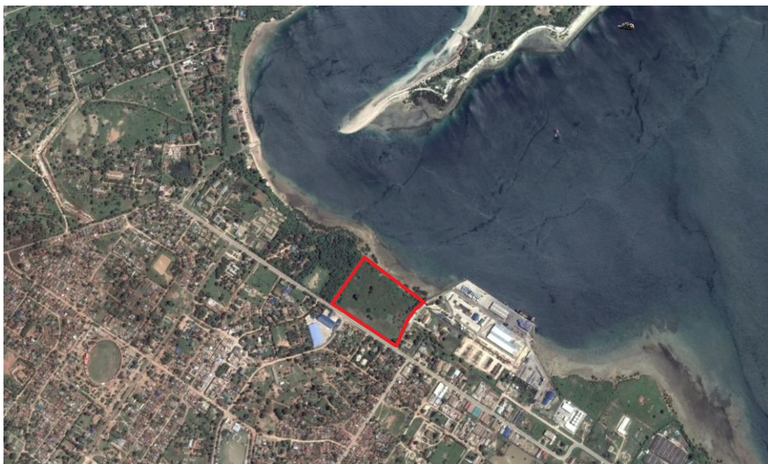
Figure 2: Location of the full area intended for encompassing the proposed Nachu Graphite Storage Facility Area adjacent to the port of Mtwara facilities