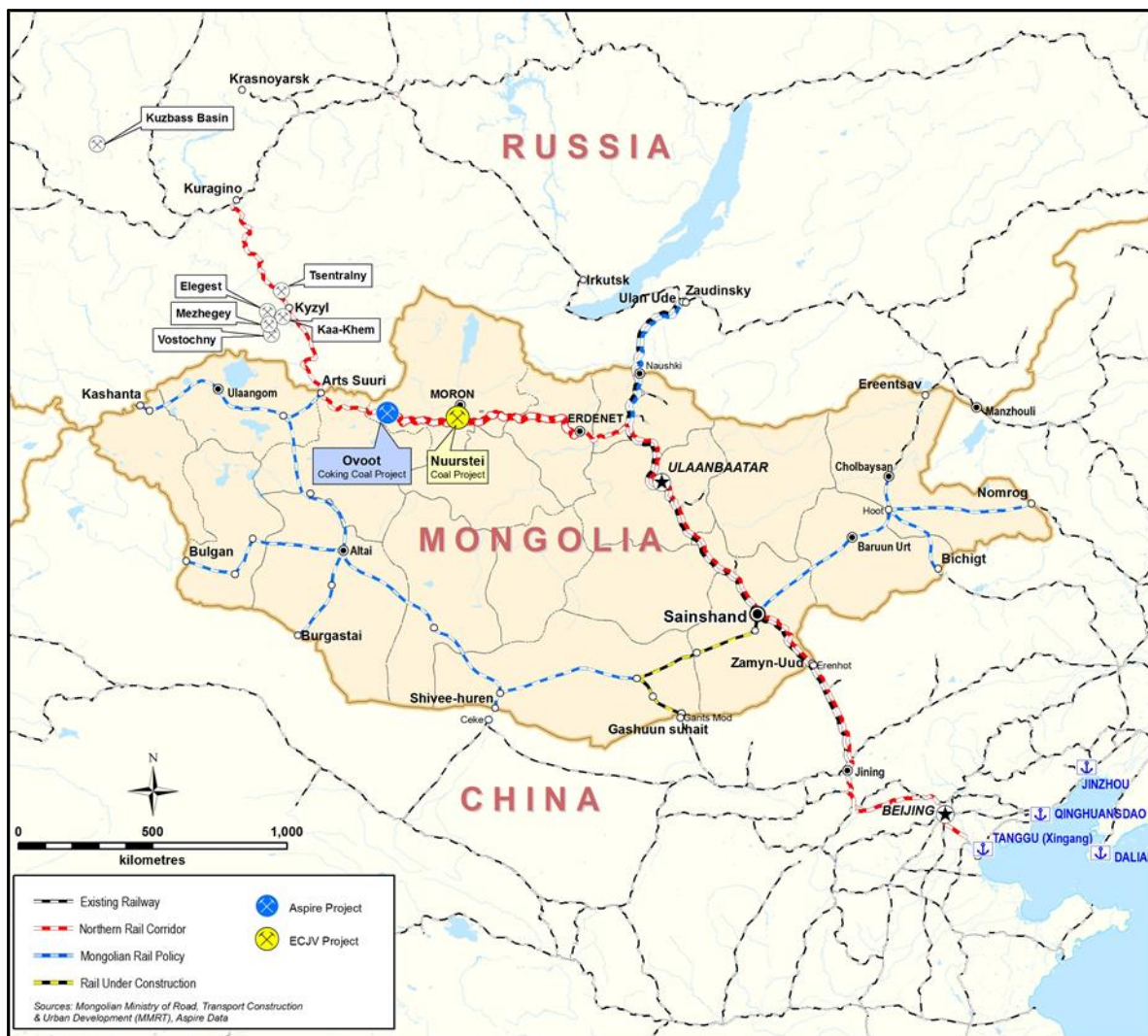
Figure 3: Erdenet – Ovoot railway forming part of the Northern Rail Corridor from the Chinese Port of Tianjin through Mongolia to Kuragino on the Trans Siberian Railway

The Northern Rail Corridor requires the completion of additional rail developments from Erdenet to Ovoot (547 kms) to Arts Suuri (200 kms) to Kyzyl (260 kms) and to Kuragino (410 kms) for a total of 1,414 kms. Each of these rail developments will be subject to identifying their commercial feasibility. Two-way trade freight along this Northern Rail Corridor will provide a long term demand for fast efficient rail freight services.