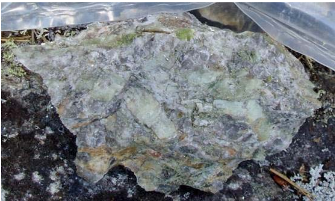
Sample from the Dempster L61 deposit. Spodumene is the pale green elongated striated mineral (sample ~17cm long left to right).