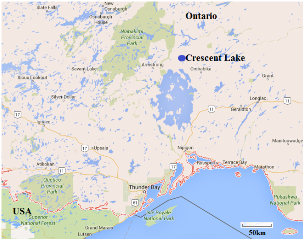
Figure 2: Regional Location, Crescent Lake is situated in the northeast portion of the Sovereign Claims above the four lithium-bearing pegmatite deposits (See Figure 1).