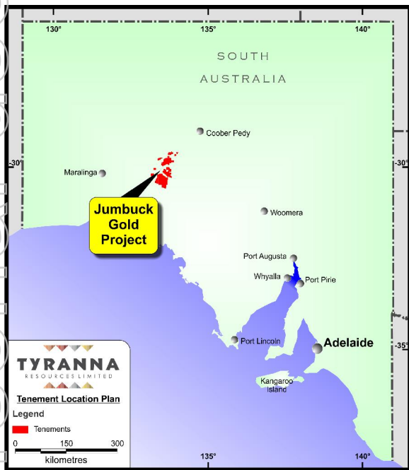
Figure 3: Jumbuck Gold Project Location Map

The potential remains that the Greenwood-Mainwood camp and Campfire Bore are geologically linked. The upcoming drill programme as well as the ongoing target generation work will go some way towards further understanding this 7km long feature. Drilling is also scheduled to start on high priority prospects in the south of the Jumbuck project subject to approvals and preliminary targeting work which is currently underway.