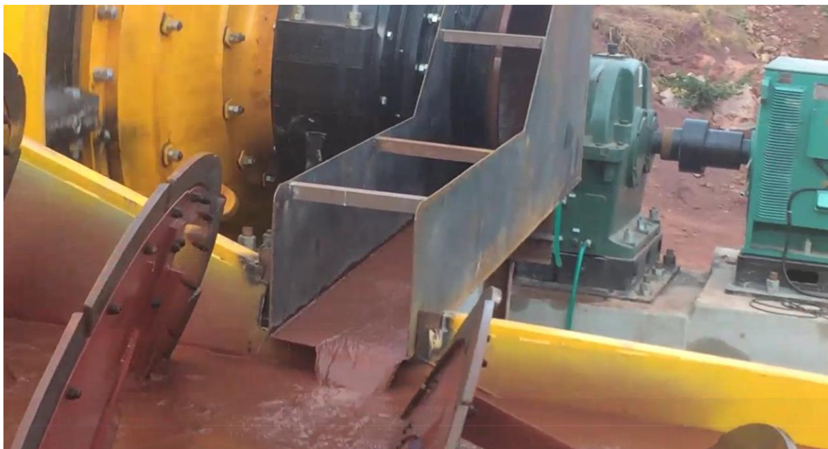
Ball mill and classifier