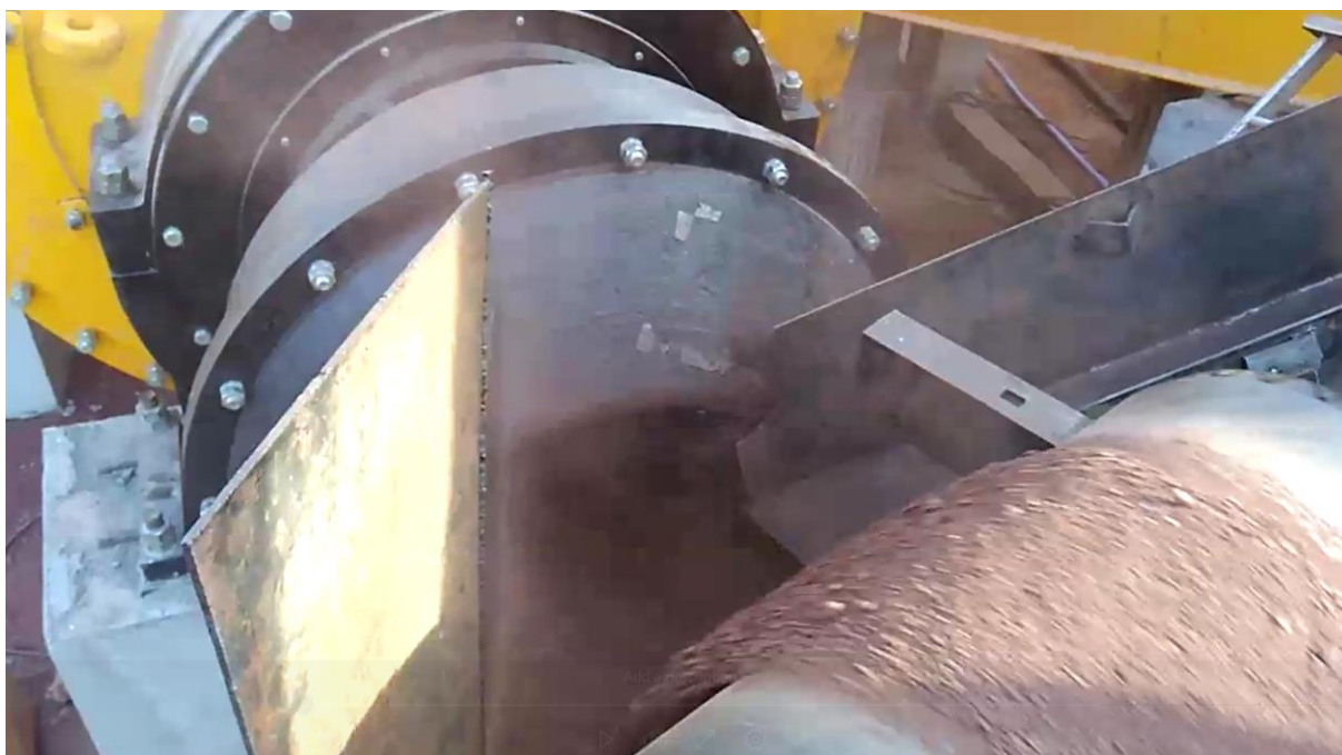
Low grade fines into ball mill