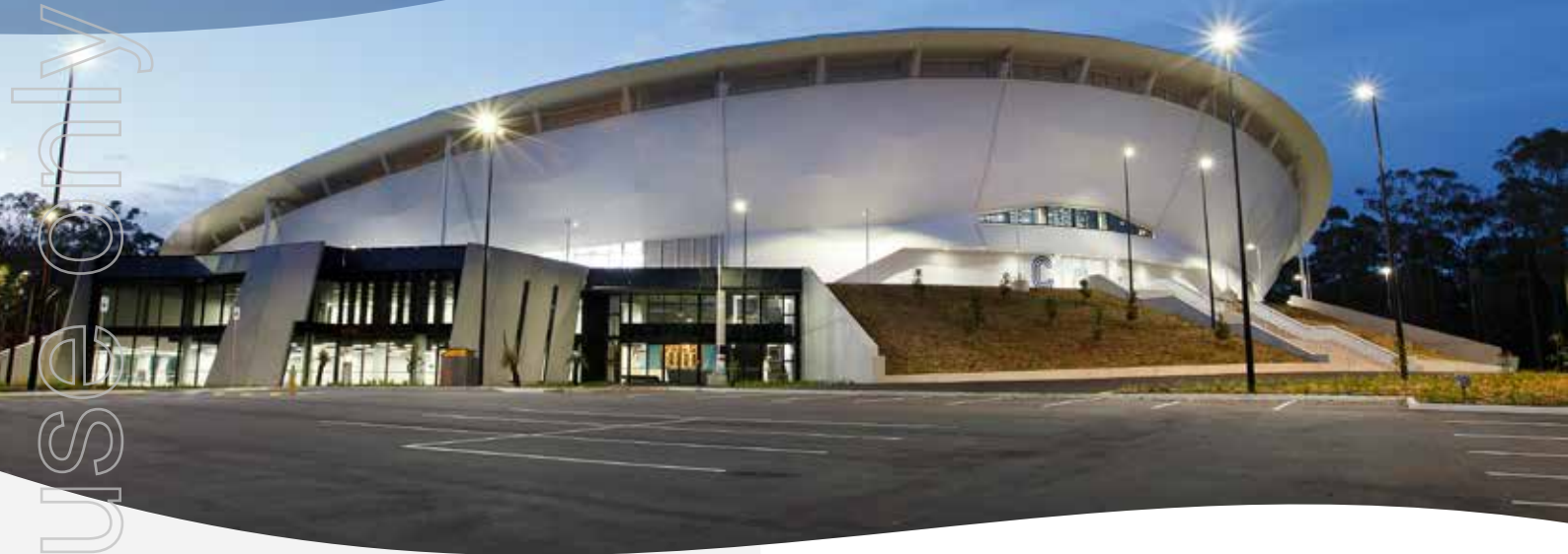
Queensland State Velodrome