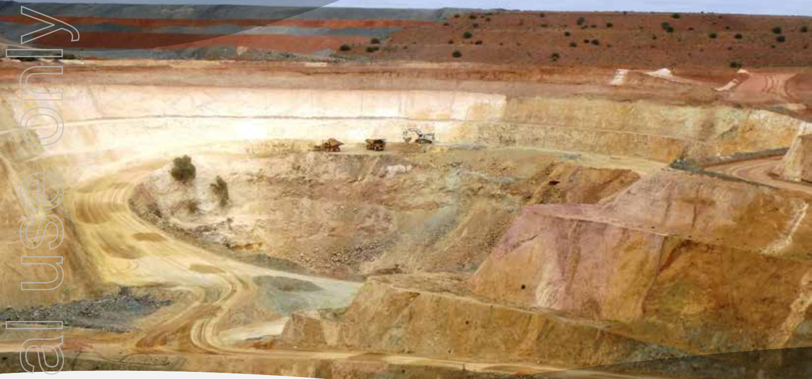
Mt Magnet Gold Mine