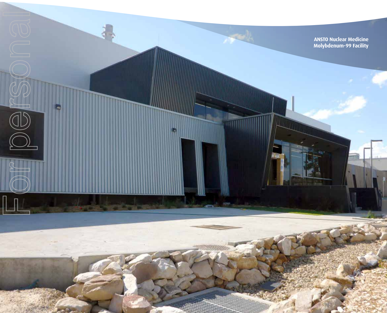
ANSTO Nuclear Medicine Molybdenum-99 Facility

This complex health and science project moved a step closer to completion in November with the arrival of the final hot cell on site. The 10 hot cells are now under construction and will be installed by a team of specialist trades from the USA. Australian Nuclear Science and Technology Organisation (ANSTO) have commenced installation of their process equipment inside the hot cells, with testing also underway. Radiation shielding engineered components are also currently being installed on site, with work nearing completion on the critical waste management systems. With all external works complete, upcoming activities are focused on the completion of the hot cells and commissioning. When complete the facility will significantly increase ANSTO’s capacity to produce the critical life-saving radioisotope molybdenum-99 for healthcare providers throughout Australia and overseas.