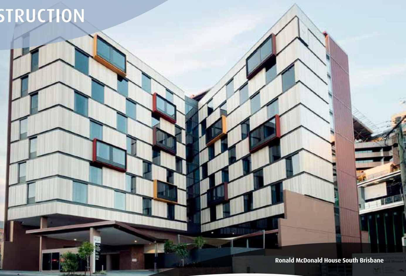
Ronald McDonald House South Brisbane