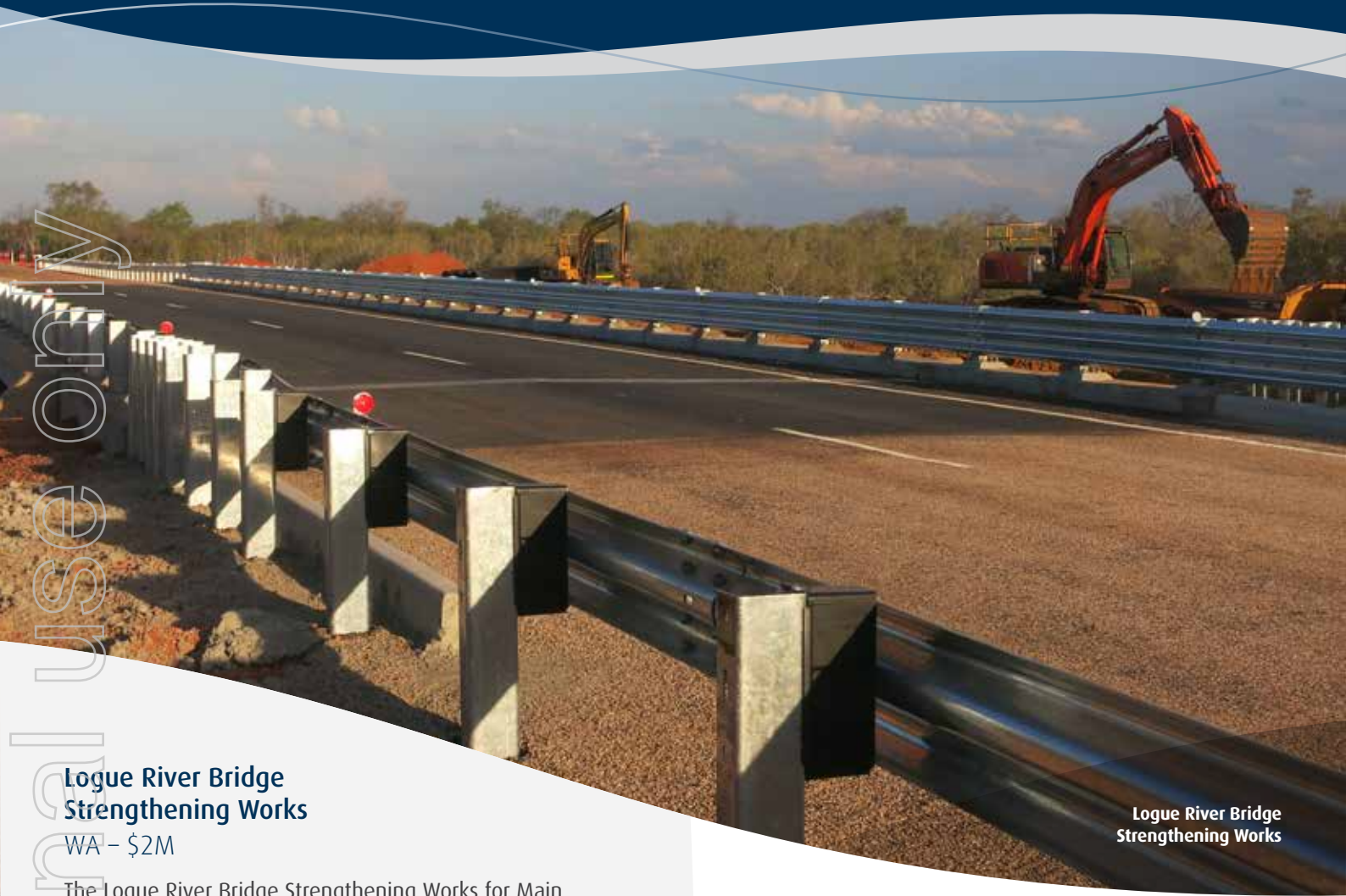
Logue River Bridge Strengthening Works

W A T P A C N A T I O N A L P R O J E C T S