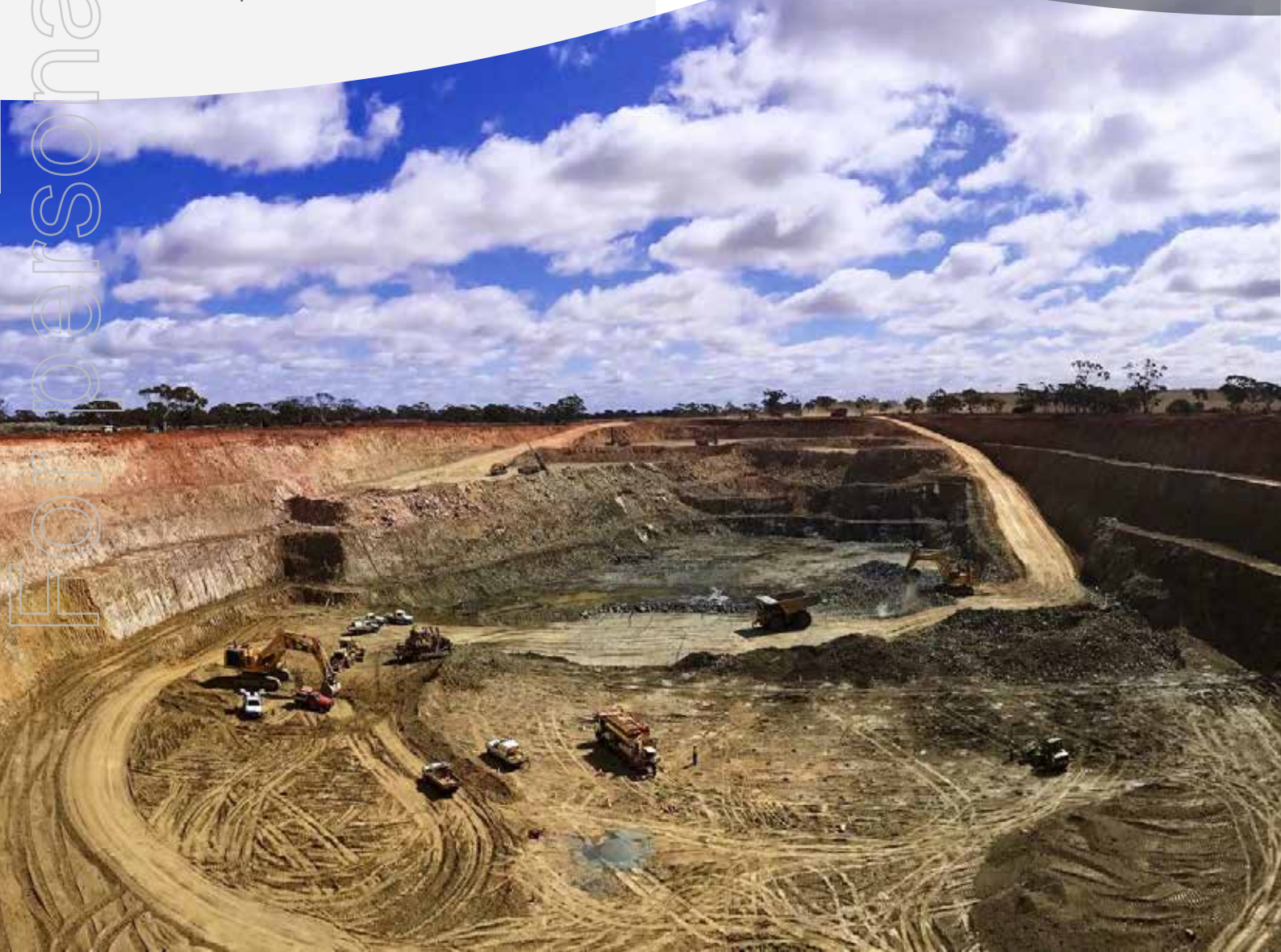
Silver Lake Imperial Majestic Pits

Watpac recently recommenced works on the Mount Barker Passing Lanes project for Main Roads Western Australia. Located in the Shire of Plantagenet, the project involves widening a 4.4 kilometre stretch along the Albany Highway to accommodate two separate passing lanes near Woogenellup Road and Martagallup Road. The project involves clearing, earthworks, drainage, pavement construction and stabilisation, sealing, kerbing, line marking and signage.