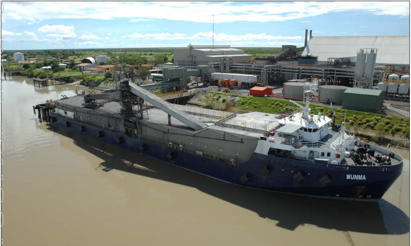
Figure 7: M.V. Wunma Transshipment Vessel

Upon cessation of operations, the M.V. Wunma was sailed to Papua New Guinea where it is currently dry docked on care and maintenance.