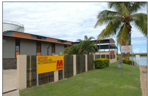
Figure 8: Pelicans Inn, Karumba

A lease over the Pelicans Inn in Karumba is also in place. The Inn remains on care and maintenance pending re-establishment of port operations and/or development of tourism potential.