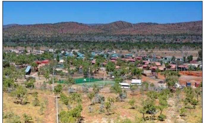
Figure 10: Century Mine accommodation camp

The accommodation precinct also includes a sewage treatment plant, water treatment plant and communication towers.