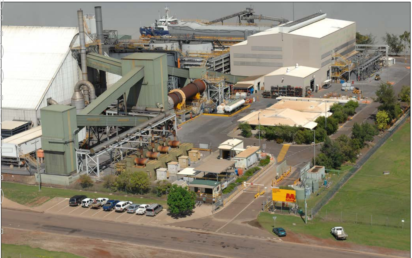
Figure 6: Karumba Port Facility

Like the Lawn Hill mine site, Century's infrastructure at Karumba has been kept in a state of operational readiness to allow for the future restarting of operations.