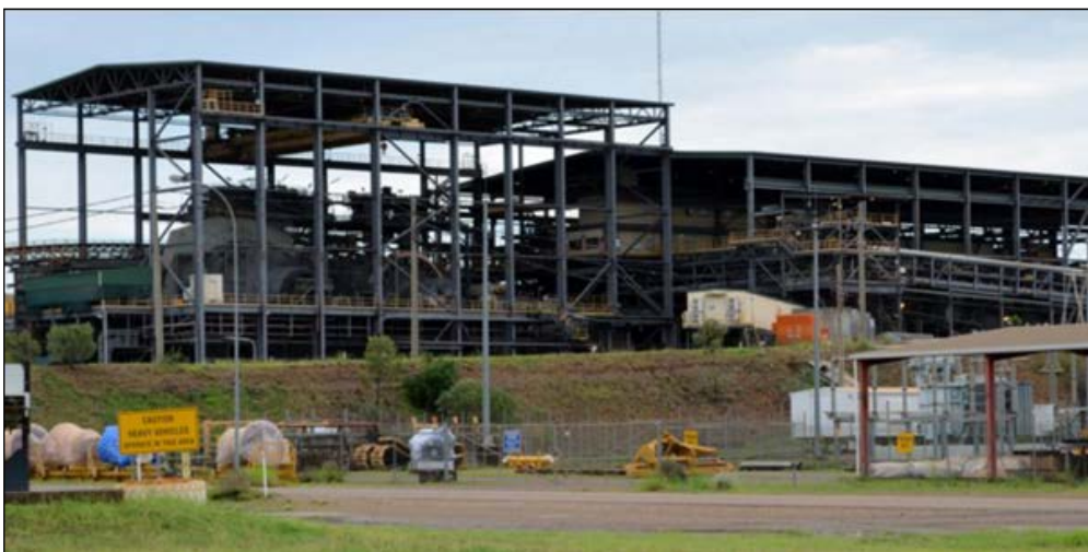
Figure 5: Century Mine processing plant & mobile fleet workshop