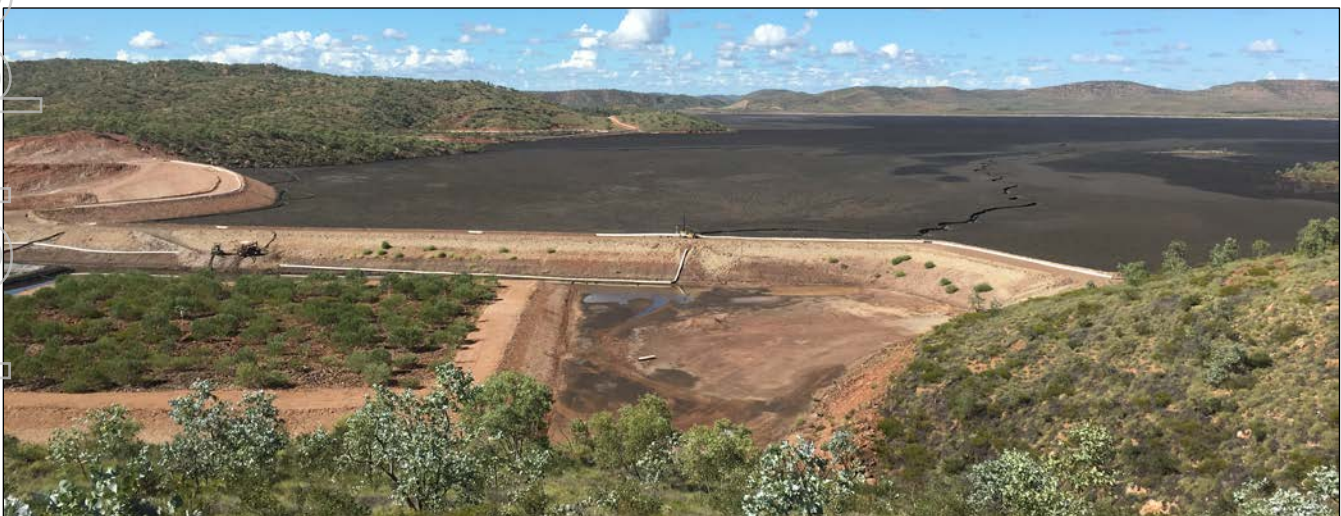
Figure 3: Century Tailings Deposit

Listing Rule 5.8.1 disclosures for the Century Tailings Deposits are located further in this announcement.