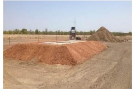
Figure 9: Century Mine underground slurry pipeline infrastructure