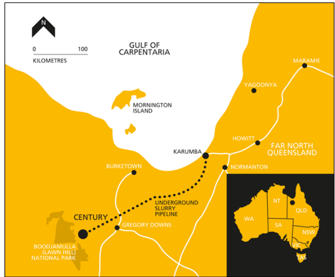
Figure 1: Century Zinc Mine regional setting

The mine has produced on average 475,000t per annum of zinc and 50,000t per annum of lead in concentrate products over the history of operations.