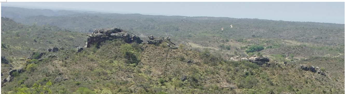
Figure 1: Large outcropping pegmatites with spodumene in Ancasti, Catamarca