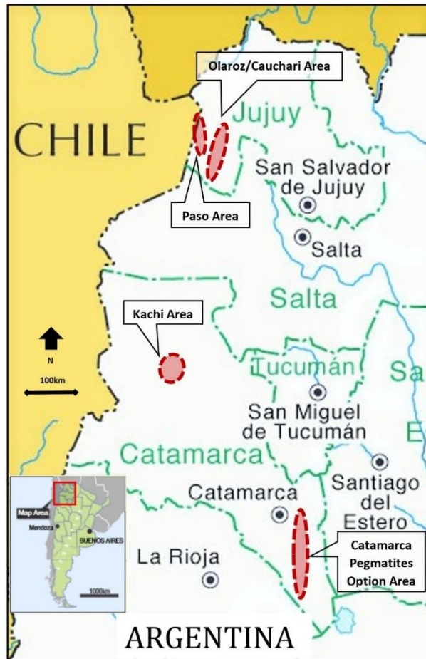
Figure 2: Location map of Lake Resources lithium brine projects (Olaroz/Cauchari, Paso, Kachi) and lithium pegmatite projects in NW Argentina