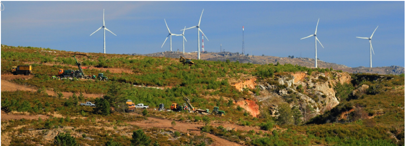
Figure 1: Sepeda project, showing two of the four operational rigs, and the Romano open pit

cash reserves to accelerate work at Sepeda by deploying four drill rigs to expedite and deliver the information required for full feasibility studies at Sepeda". "The Dakota team continues to deliver on its milestones with the maiden Mineral Resource statement completed ahead of schedule while defining the largest JORC lithium pegmatite resource in Europe" Frances said.