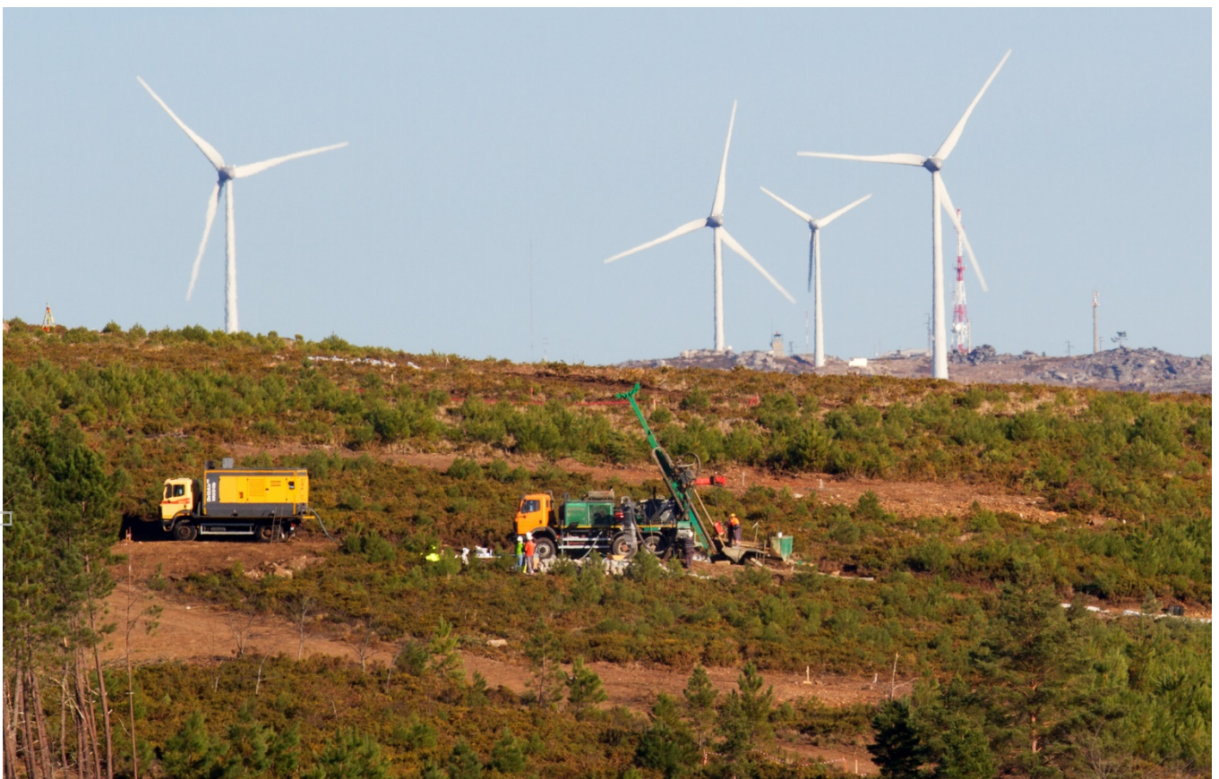
Figure 2: Drilling at Sepeda project, with wind turbines in the background.