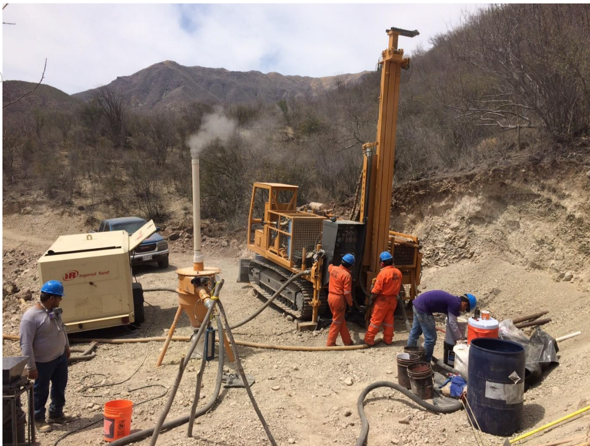
Figure 2 Reverse circulation drilling at the Agua Fria prospect, Mexico. The volcanogenic sediments that host the lithium mineralisation can be clearly seen to the right of the drill rig.

The planned duration of the drilling campaign is 44 days. Laboratory assays will be conducted in Mexico and subjected to quality control and audit procedures developed jointly by LIT and AIX. Metallurgical evaluation will be undertaken by Kappes Cassiday and Associates, in Reno, Nevada.