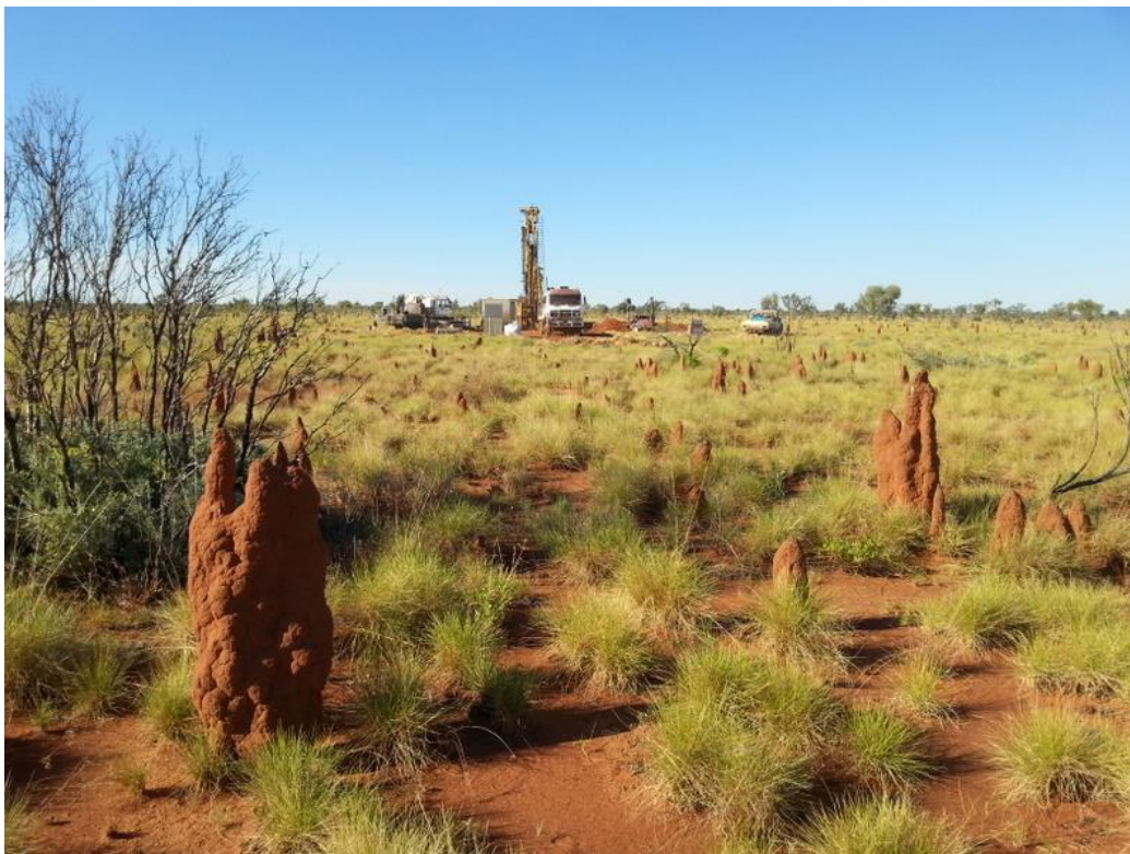
Photograph 1. Diamond drilling underway at Homestead

ABM Resources (ABM) is pleased to advise that diamond drilling has commenced on its 100% owned Homestead Prospect in the Tanami Region of the Northern Territory. The planned drillhole is the first test of an innovative soil sampling assaying method trialled by ABM in 2013. The target is an early stage exploration target being tested as part of ABM's strategy and is aimed to discover the next generation of large gold deposits through effective green fields exploration.