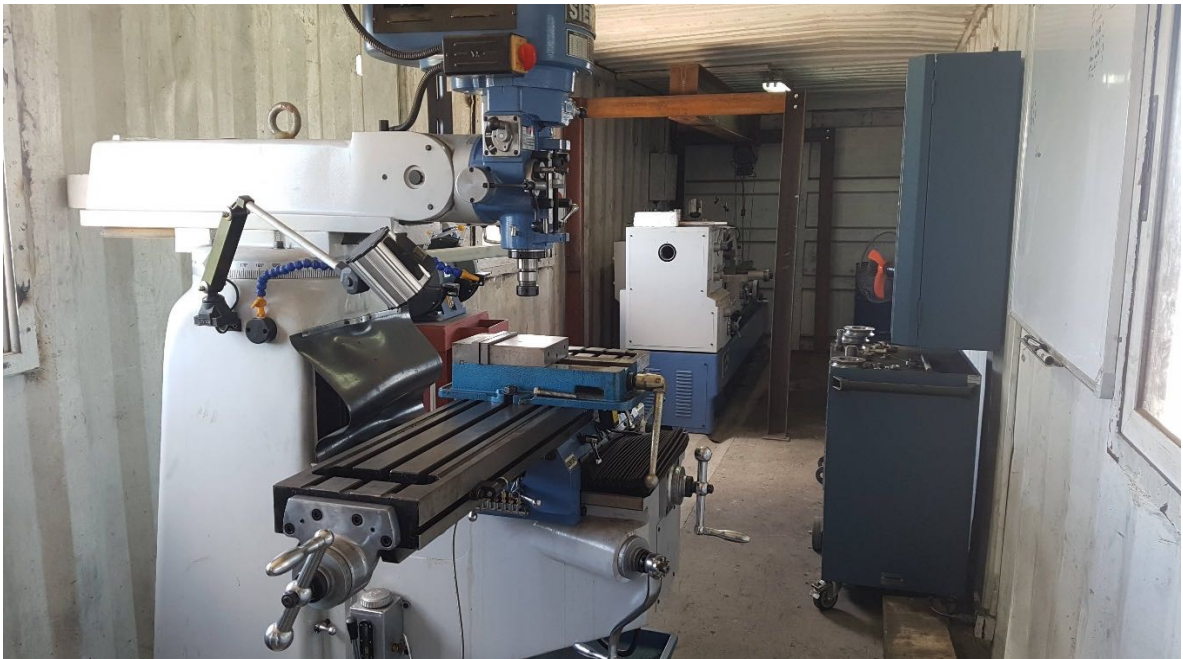
Figure 11: Specialist workshop equipment delivered and installed, with many required items being fabricated for equipment and plant refurbishment.