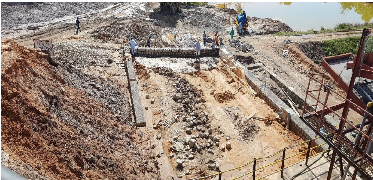
Figure 4: Civil works underway for re-grind line extension.