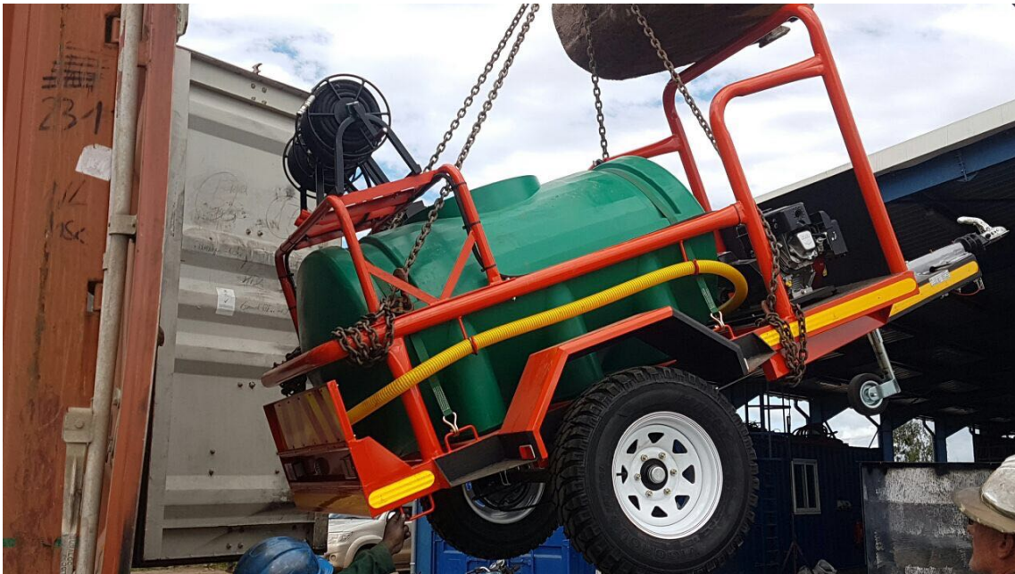
Figure 2: Unloading of the new Fire Fighting Trailers at Graphmada.

Another significant safety initiative has been realized at Graphmada with the arrival of two Fire Fighting Trailers. The trailers are critical equipment required for mine re-commissioning and camp safety.