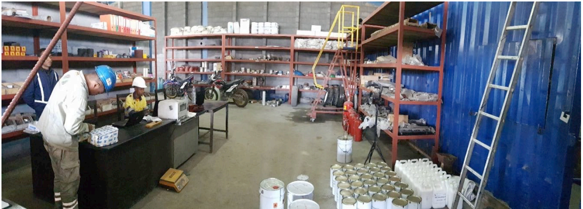
Figure 10: New Stores protocols and item tracking in place.