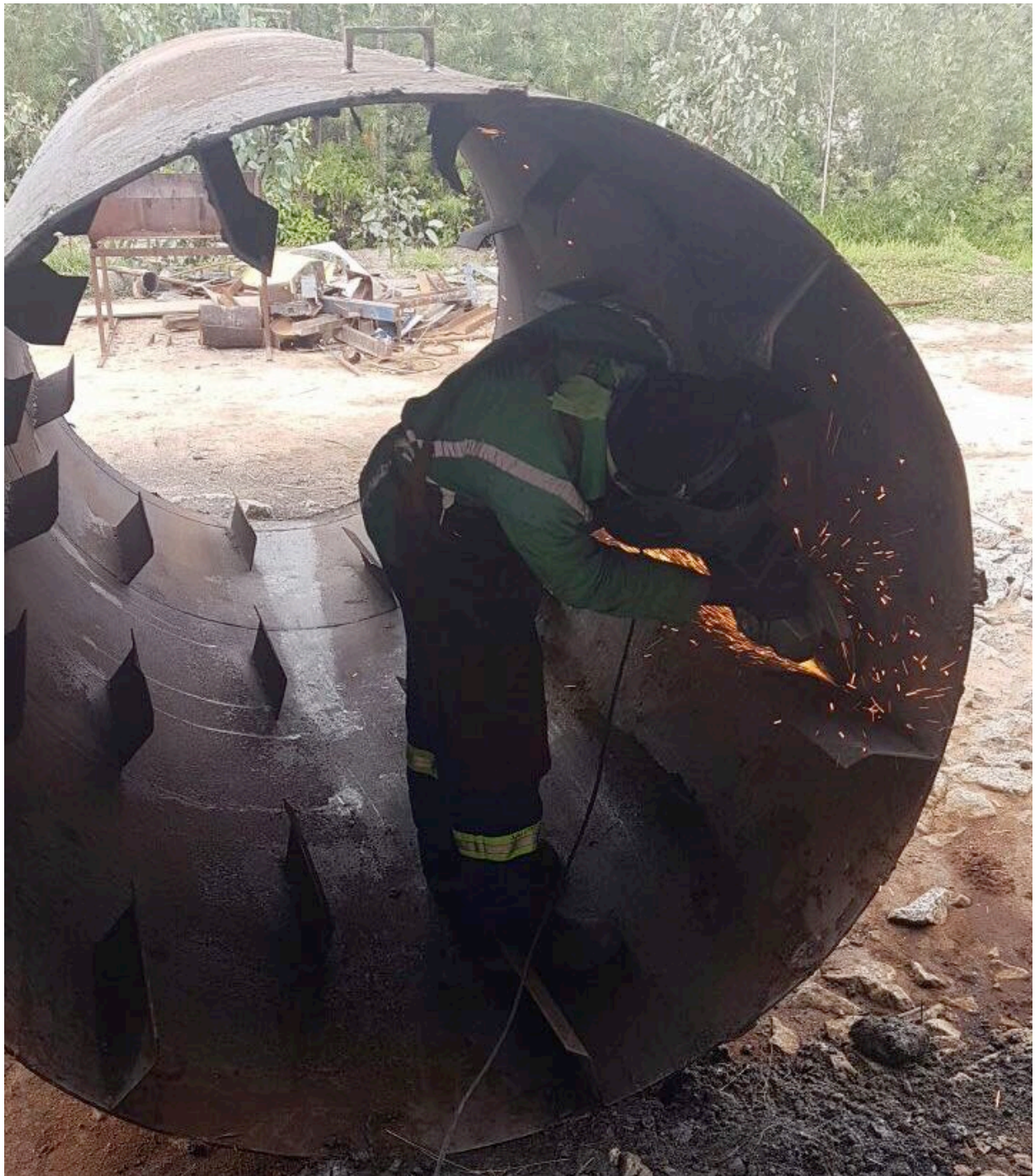
Figure 7: Refurbishment of decommissioned rotary dryer drum to become the new Spinners feed bin.