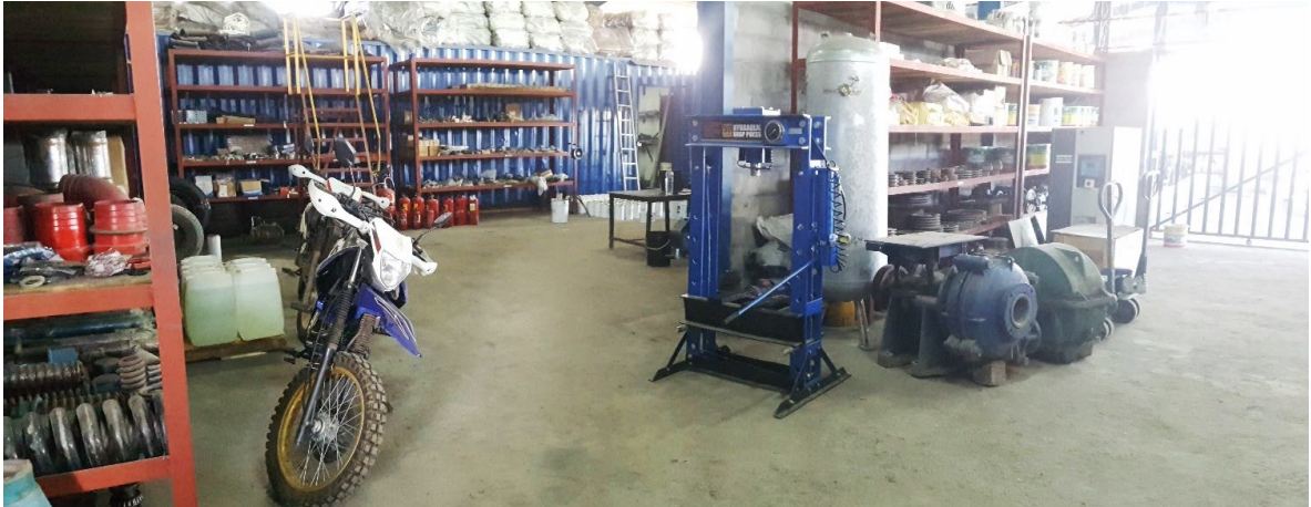
Figure 9: New stores area as part of the new workshop.