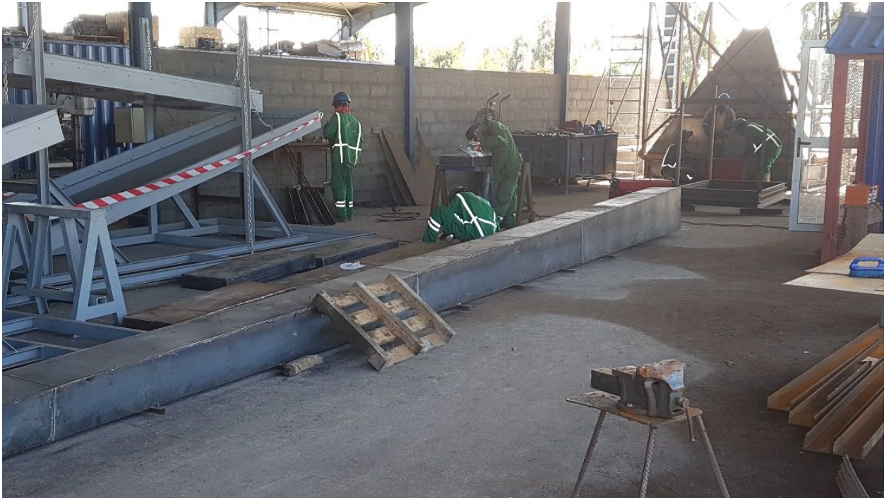
Figure 5: Onsite manufacturing of components in the recently completed workshop, now fully tooled.