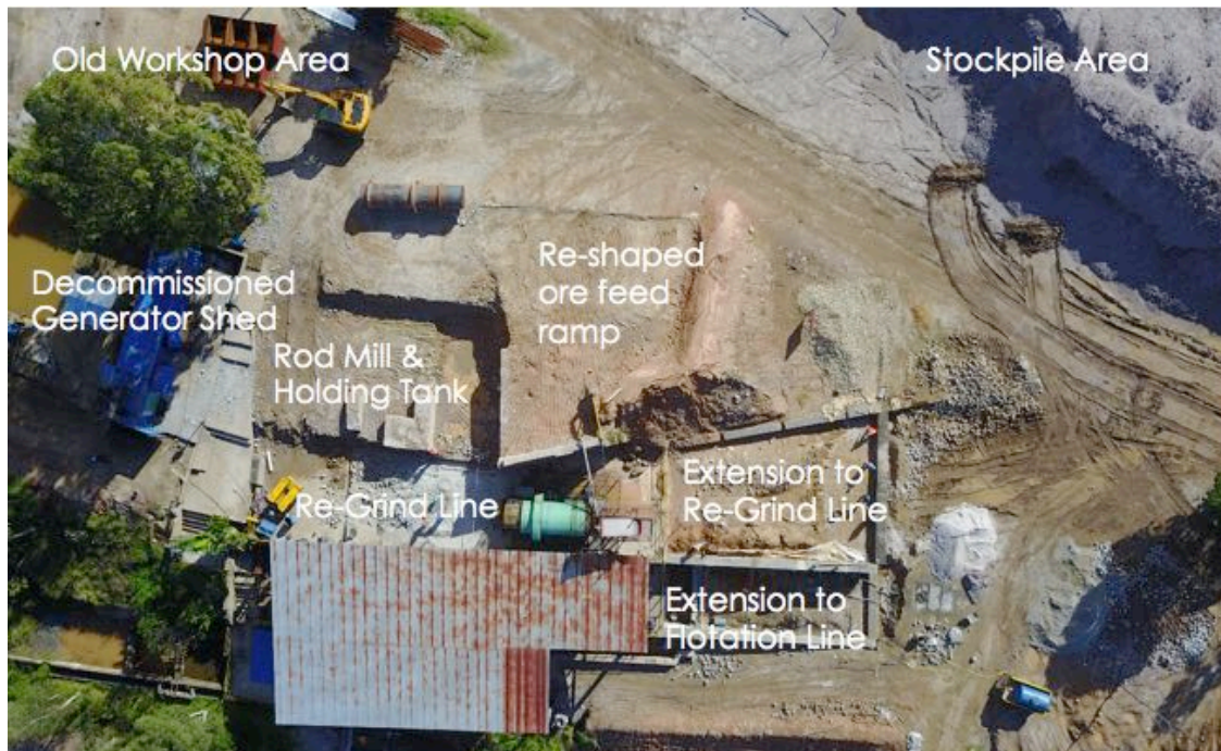
Figure 1: Process Plant with civil work underway to extend foundations and reconfigure equipment layout.