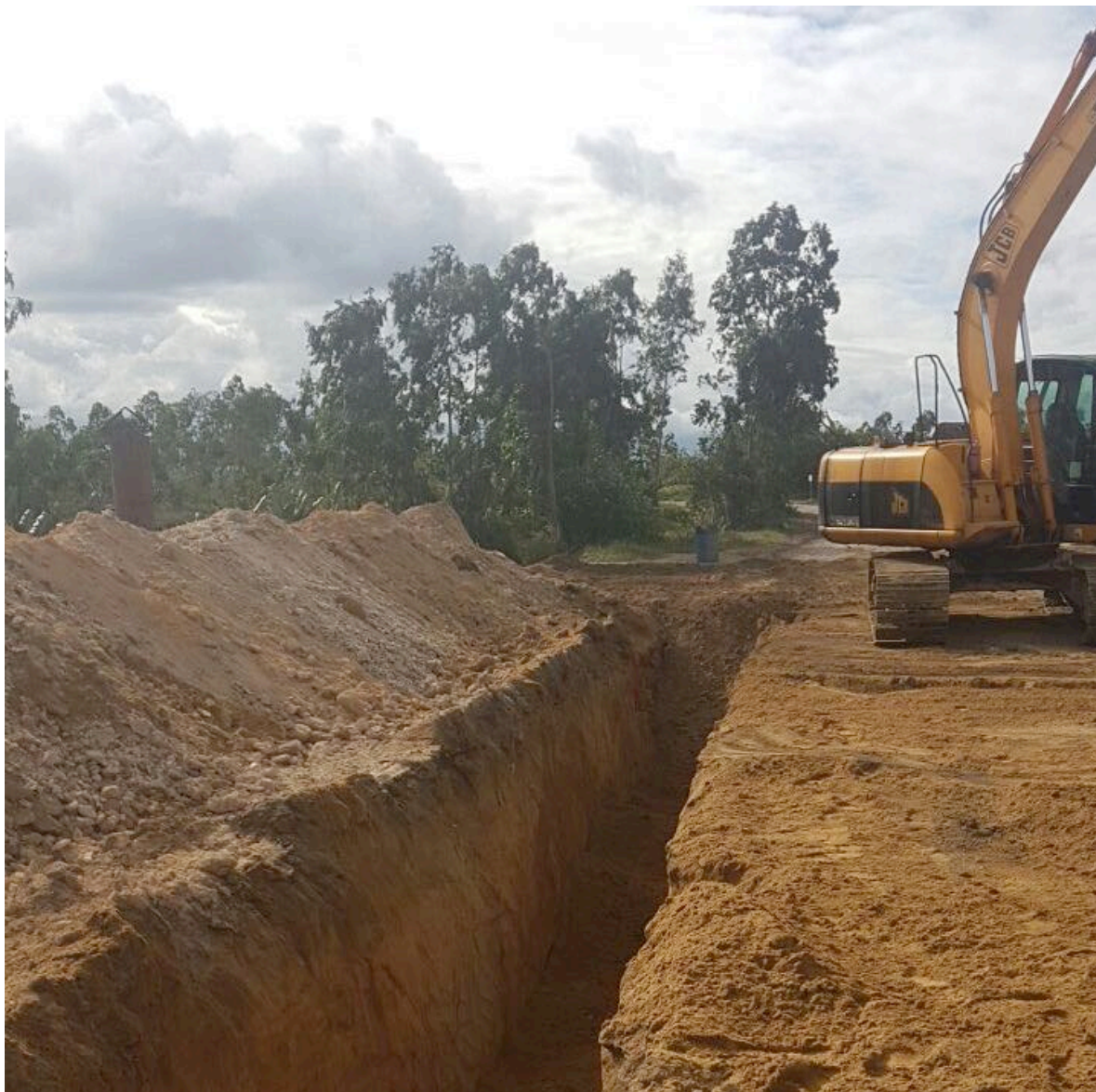
Figure 8: Trenching for installation of fibre optic Internet cable to Process Plant.