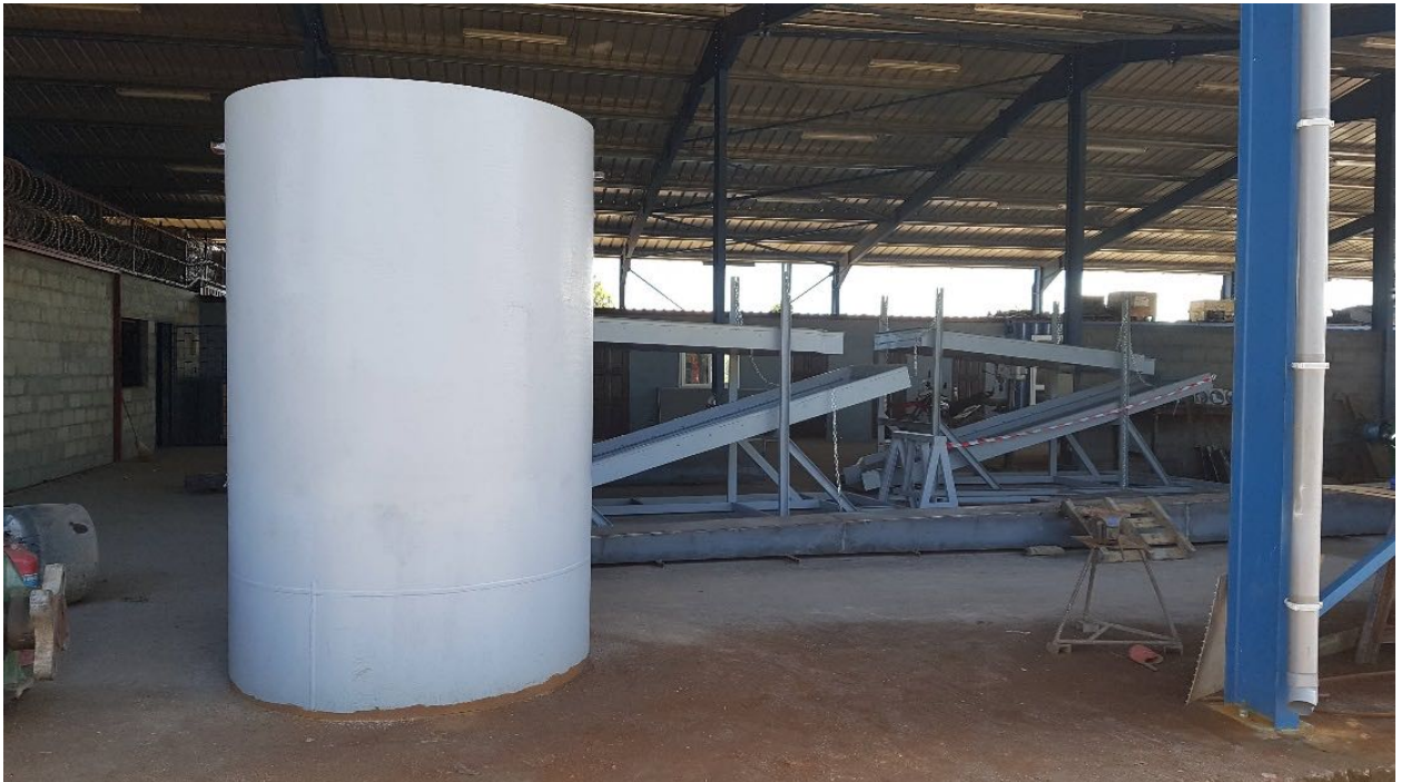
Figure 6: Onsite manufacturing of components a key element of low capital expenditure.