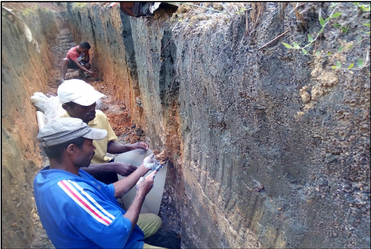
Sampling the northern face of Trench 1

Additionally, a programme of extended trenching is underway, with a total of 600 line metres completed to date. Although primarily used as an exploration targeting tool, the technique is nonetheless useful in ascertaining continuity in drill-intersected mineralisation. Trench 1, comprising 320m at an average depth of 2m BNS (below natural surface), exposed 2 zones of strong graphite flake mineralisation averaging 20m in thickness and separated by 50m across strike. A total of 52 x 1.5m assay channel samples have been collected from these zones. The photos following show sampling operations and a close-up of the coarse flake graphite exposed in the (northern) trench wall respectively.