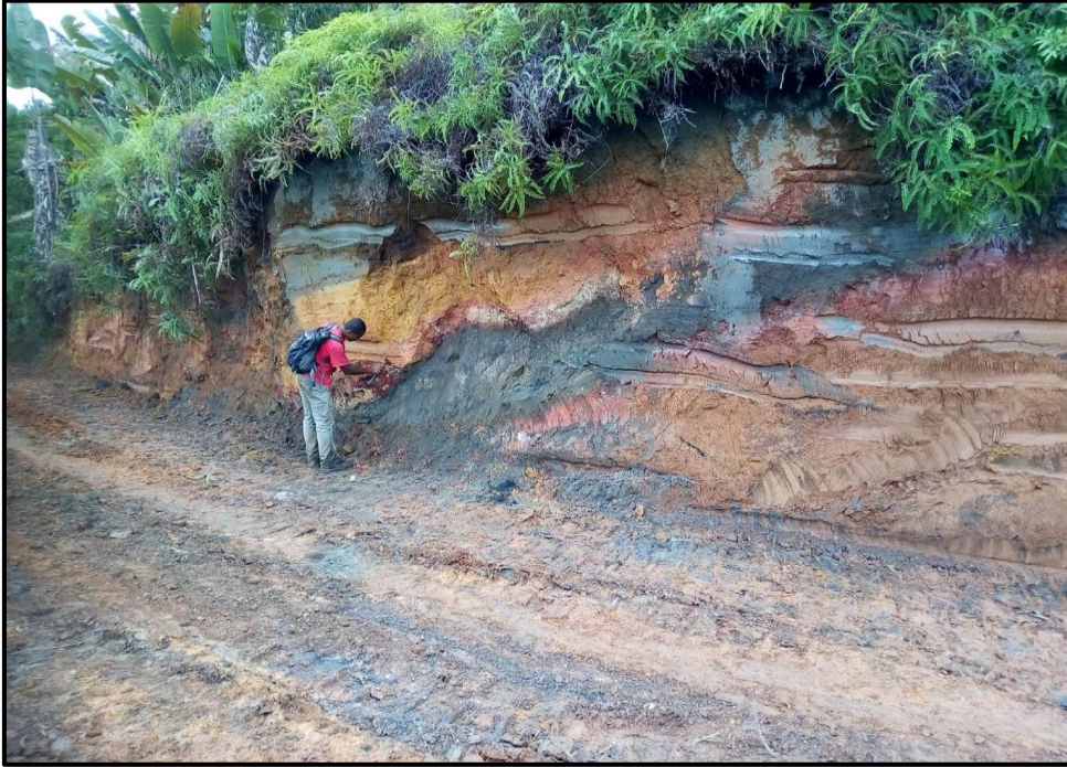
Graphite seam with adjacent disseminated zones exposed in road cut in Main Zone