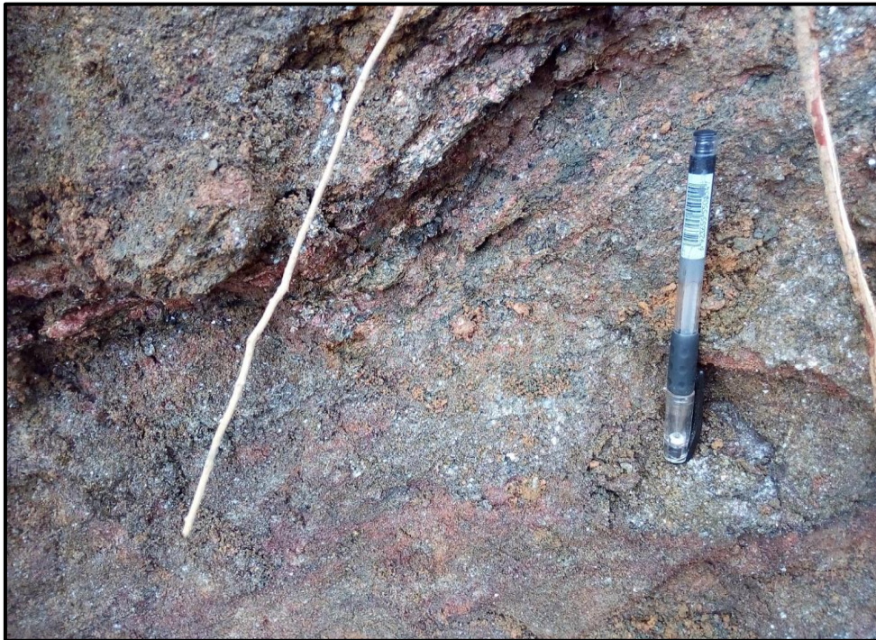
Close-up of the mineralisation