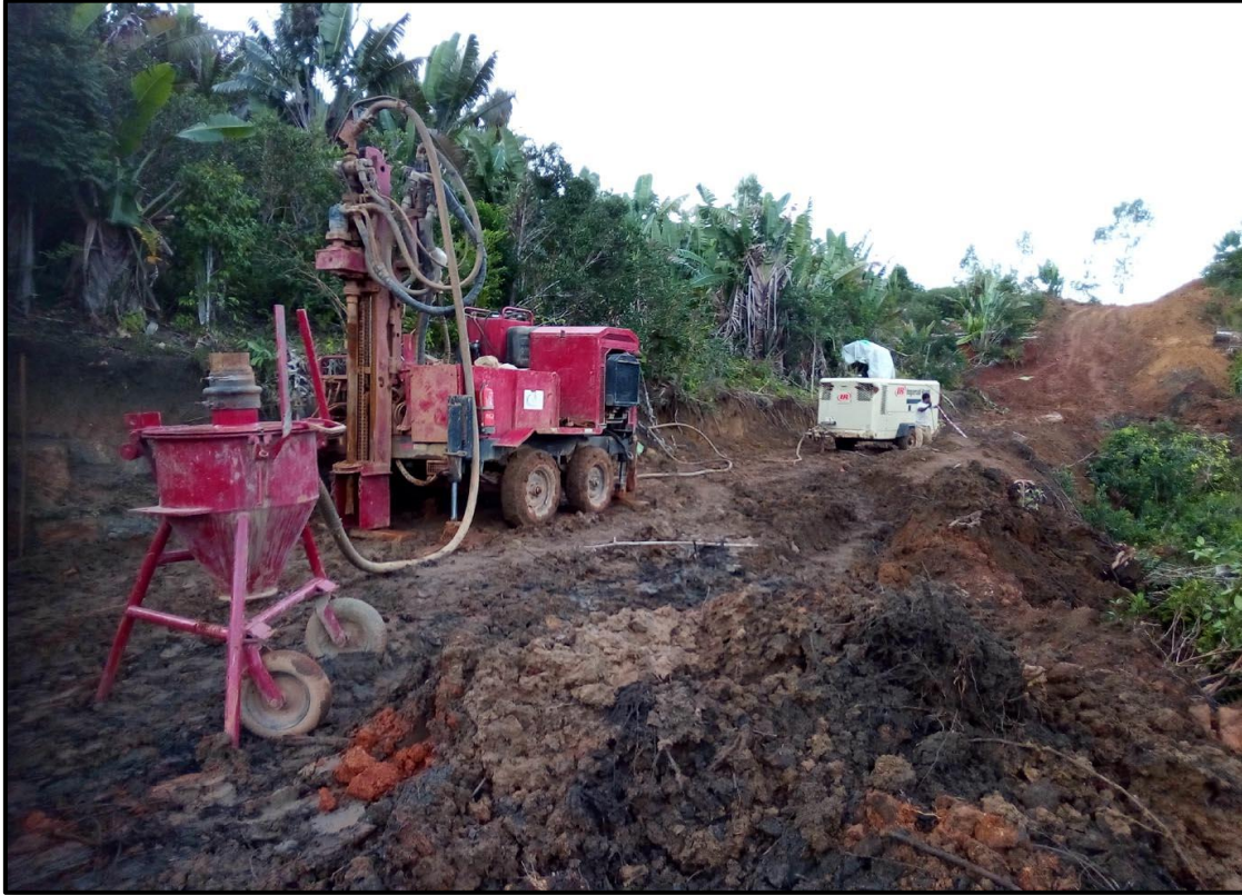
Drilling at the Main Zone