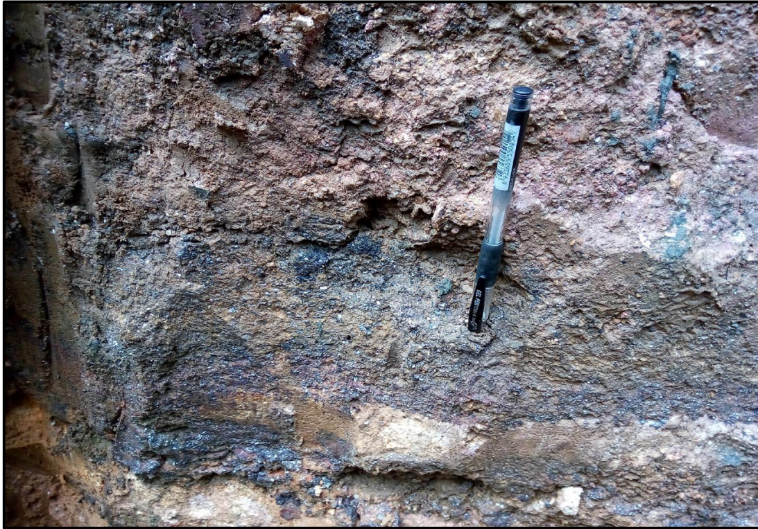
Close up of a graphite seam in the north face of Trench 1

The Company is highly encouraged by what is being observed at site, even though the Main Zone drilling programme is at a very early stage. Holes are averaging >20 metres in depth before blade refusal is encountered. This indicates significant volumes of weathered, free dig material. Significant thicknesses of mineralised material are being encountered; frequently in excess of 15 metres vertical thickness.