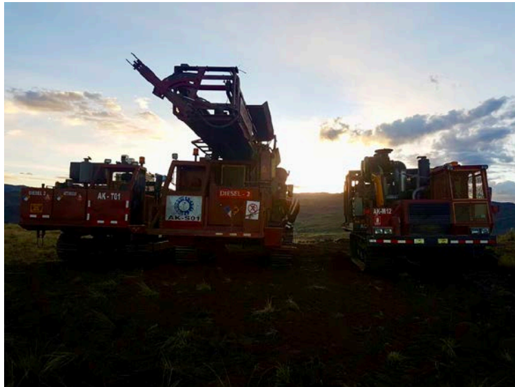
Drilling Rig & Equipment at Berenguela

Valor Resources Limited ("VAL" or the "Company", ASX: VAL) is pleased to announce that the previously announced 9,570-meter infill drill program has commenced at the Berenguela Copper-Silver Project located in the Puno Department of Southern Peru.