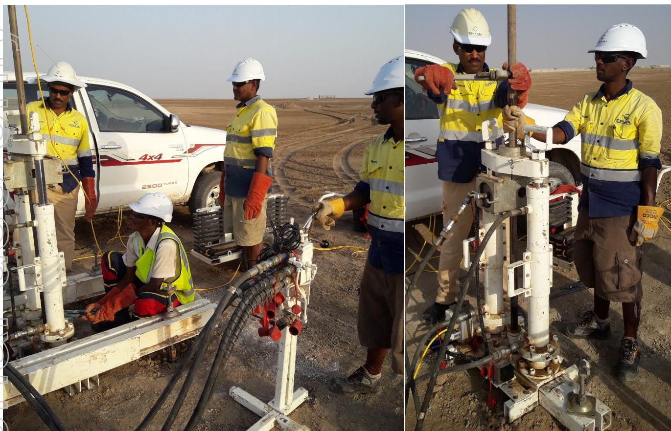
Photo: Pre-construction geotechnical work at Colluli