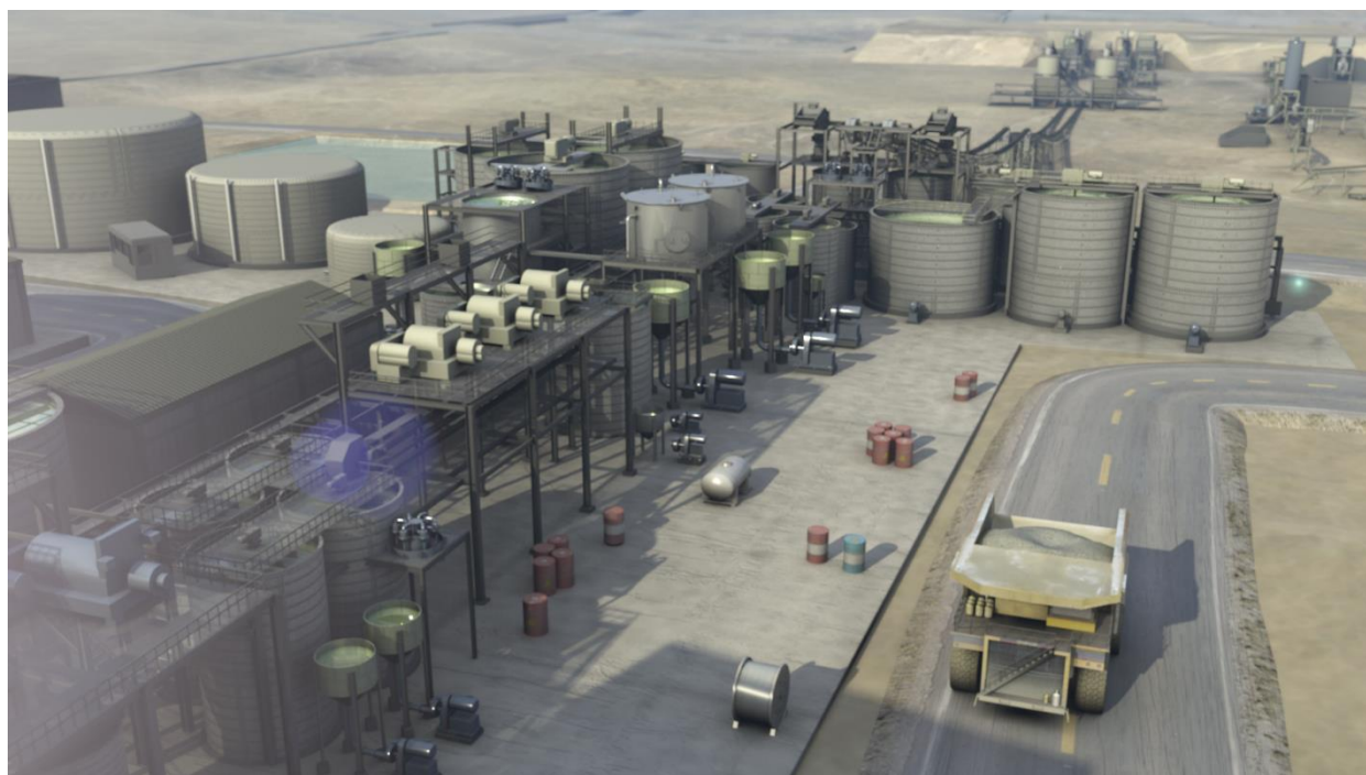
Figure 1: Colluli Process Plant Design