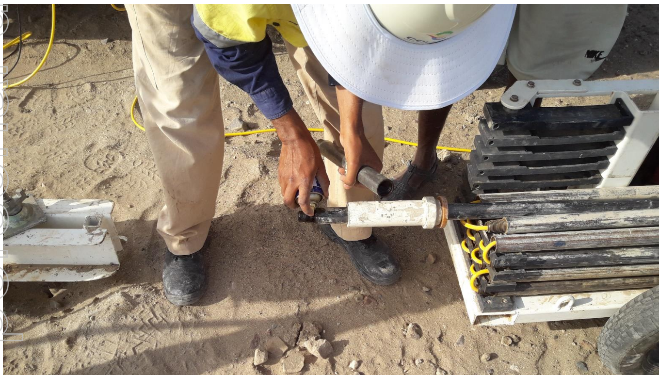
Photo: Pre-construction geotechnical work at Colluli

Significant characterisation work has been completed in prior studies.