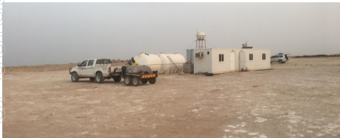
Photo: Colluli exploration camp hosting site visit