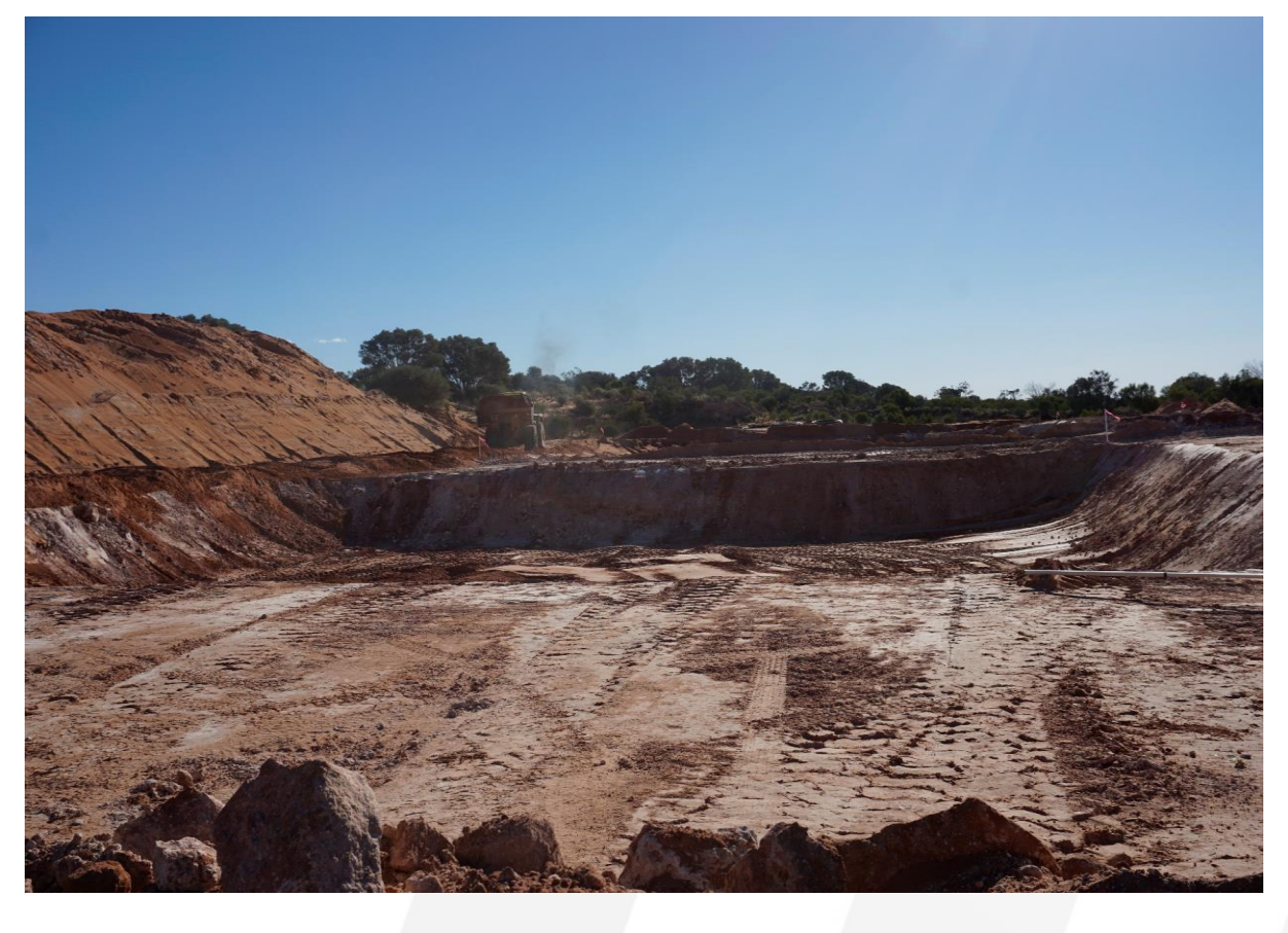
Figure 2: Sediment Ponds