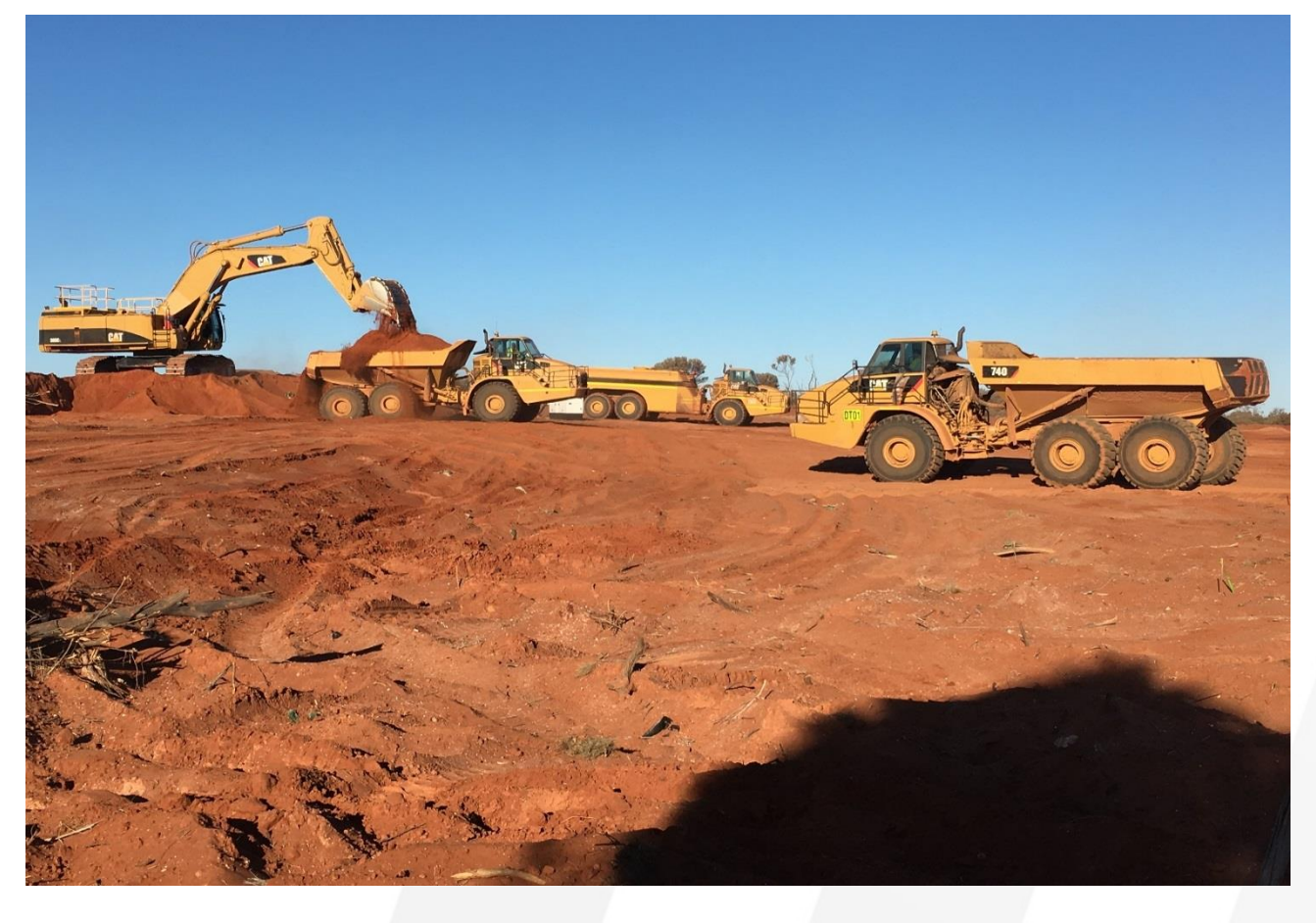
Figure 4: Overburden Mining in the North Pit