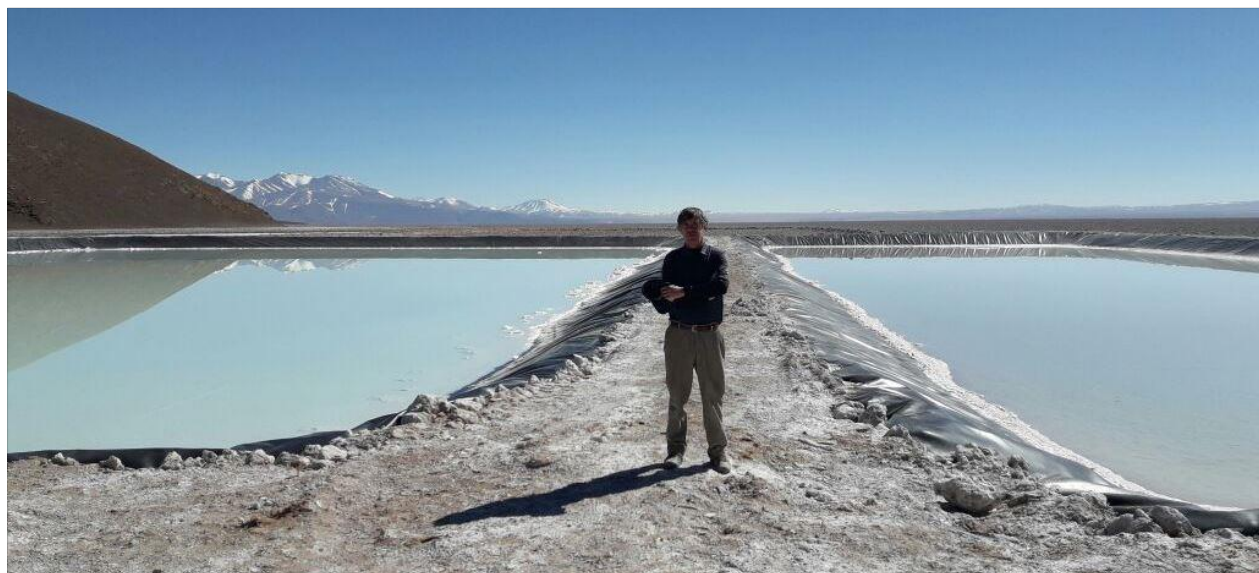
Photos 1 & 2. Rincon Lithium Project – Lithium brine pumping completed for initial ponds.