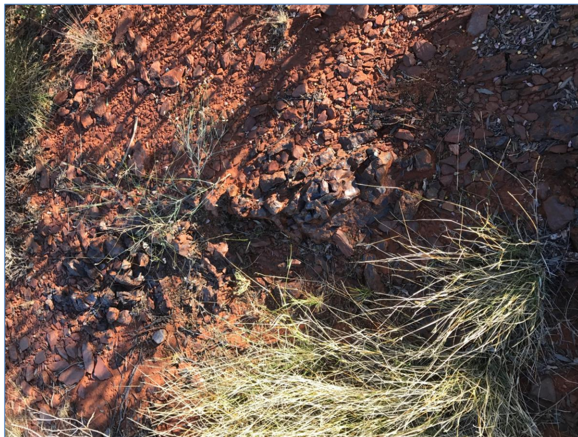
Figure 2: Photo of ferruginous gossan representing the outcrop of the Grapple Prospect mineralisation