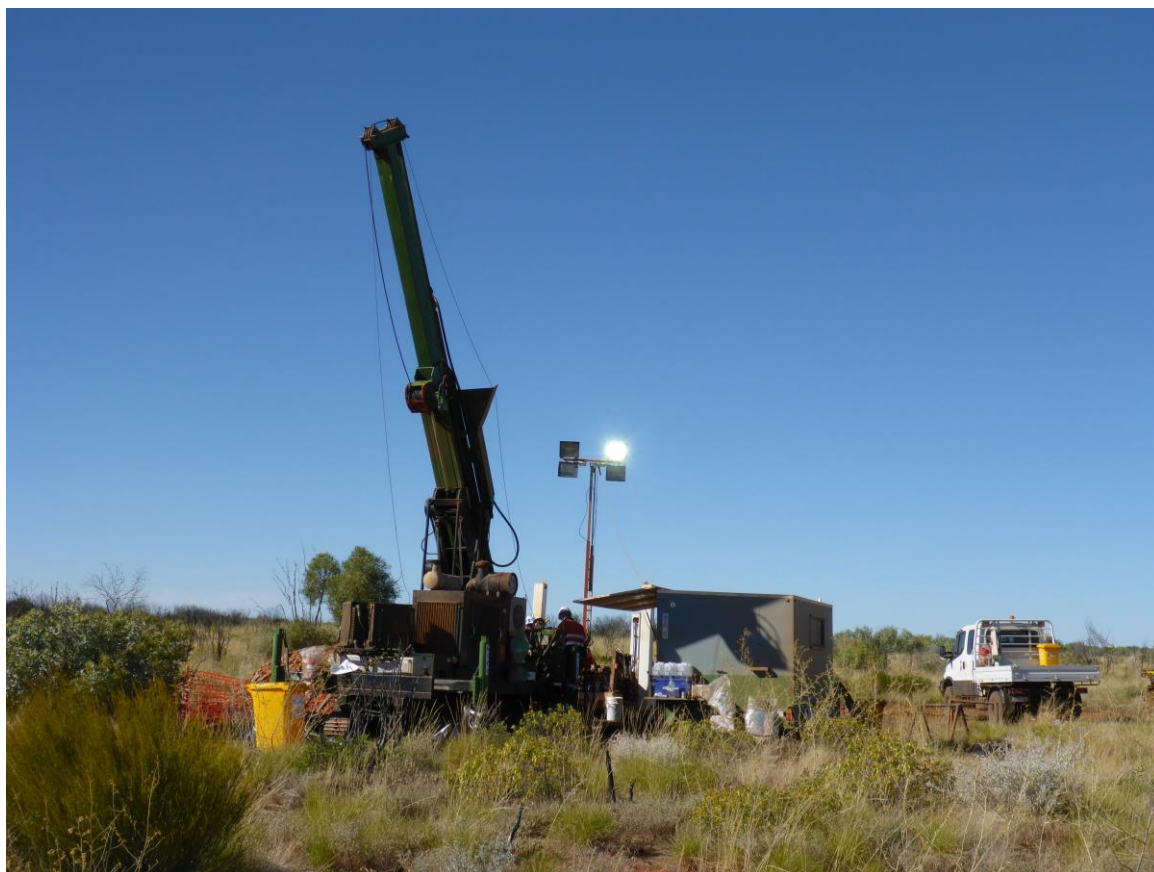
Figure 1: Photo of diamond drill rig at the Grapple Prospect