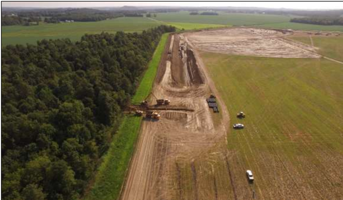
Construction of Levies Surrounding the Poplar Grove Mine

Paringa Resources Limited (“ Paringa ” or “ Company ”) is pleased to provide an update of the construction of the Poplar Grove mine (“ Poplar Grove Mine ”). Paringa looks forward to providing regular updates of the construction of the Poplar Grove Mine with photos and videos uploaded regularly to the Paringa website: www.paringaresources.com .