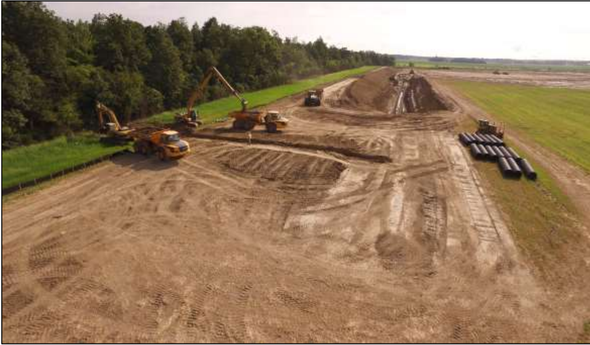
Construction of Levies Surrounding the Poplar Grove Mine