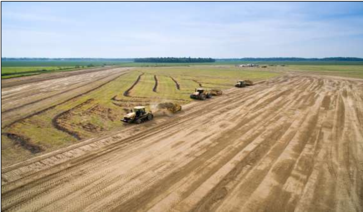
Site Preparation Activities at Poplar Grove Mine