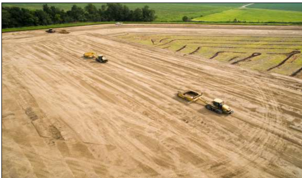
Site Preparation Activities at Poplar Grove Mine