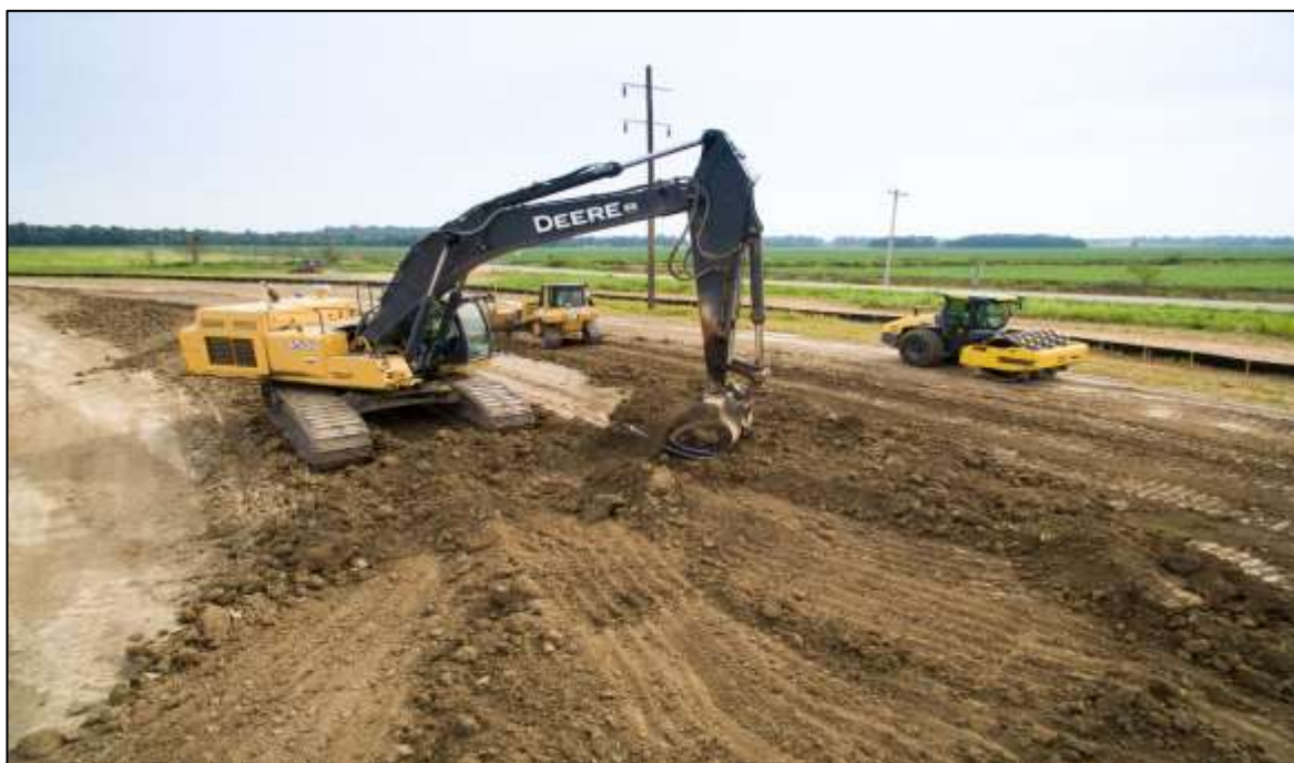
Site Preparation Activities at Poplar Grove Mine