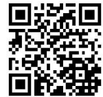
Scan QR Code using smartphone QR Reader App

STEP 3: Enter your Voting Access Code (VAC):