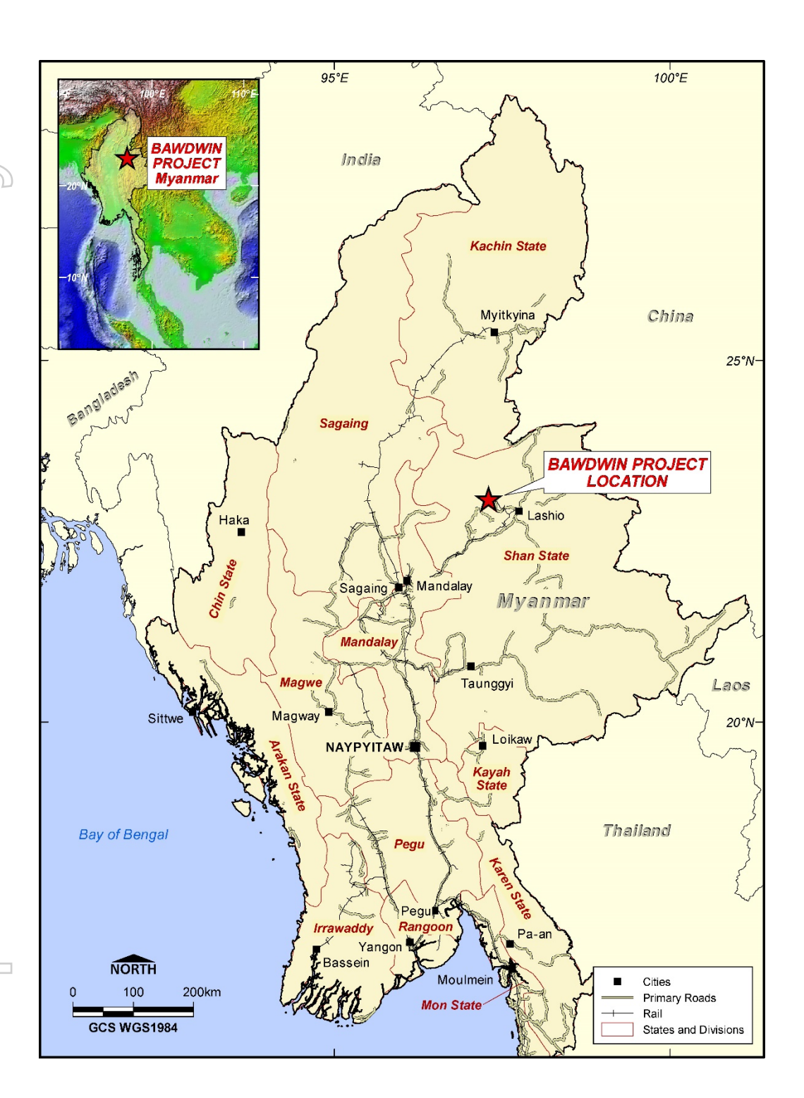
Figure 1. Location map for the Bawdwin Project

During its years of underground production, the primary exploration method at Bawdwin was via driving exploration cross-cuts into the footwall and hangingwall of the main lodes. Most underground exploration occurred above the No. 6 level, with drives at intervals of 20 to 60 metres extending from 20 to 100 metres from the main lodes and with some drives extending up to 200 metres. Underground exploration was limited from the No. 7 to 12 levels. The