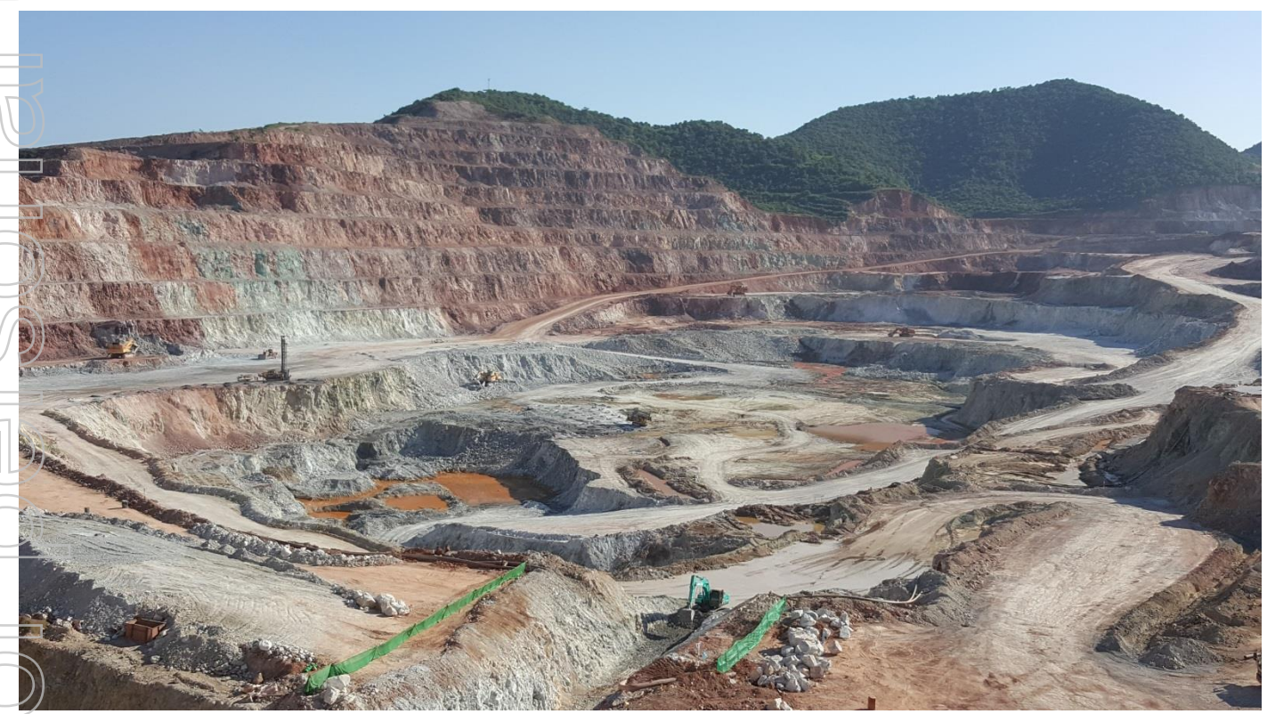
One of Wanbao Mining Limited's copper mines in Myanmar that is expected to produce over 100,000 tonnes of cathode copper next year from an extremely efficient bacterial sulphide leaching operation.

Kalkaroo is one of the largest undeveloped copper-gold projects in Australia, containing JORC Measured, Indicated and Inferred resources of 232 million tonnes of copper and gold for over 1.1 million tonnes of copper and 3.3 million ounces of gold (refer ASX announcement 29 March 2017). The project is capable of producing high quality coppergold concentrates plus copper metal (as native copper) and gold dore. To develop the Kalkaroo project at an optimum mining and throughput rate requires a major capital investment and considerable operational expertise.