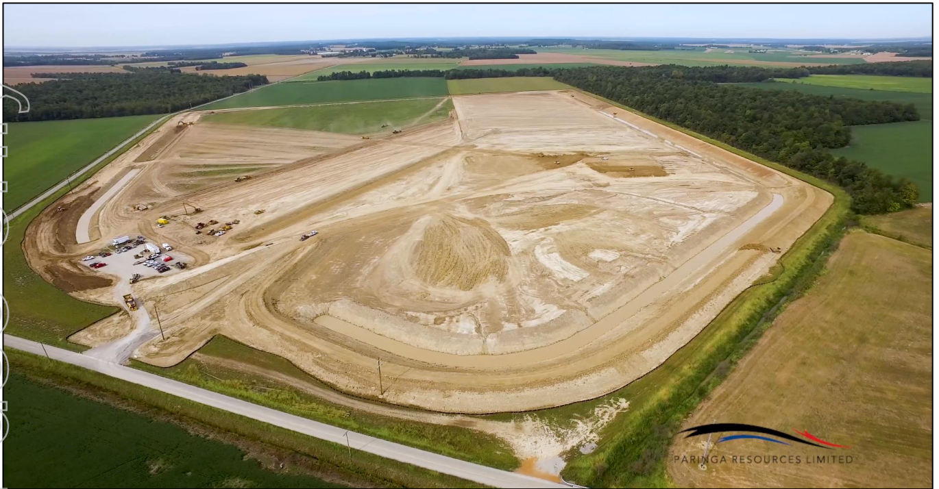
Mine Site Excavation and Development Continues at Poplar Grove Mine