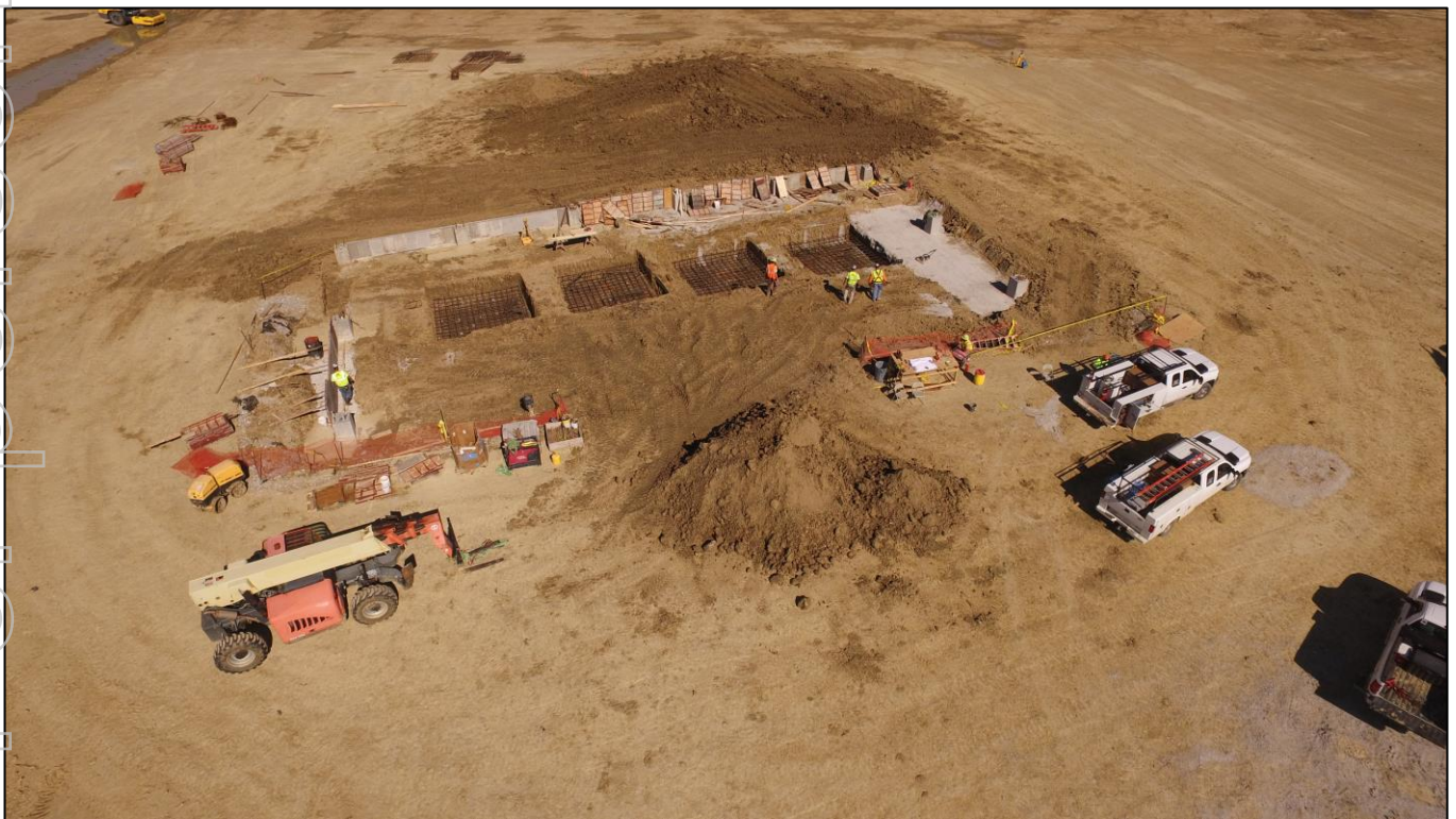
Preparing Foundations at the Preparation Plant at Poplar Grove Mine