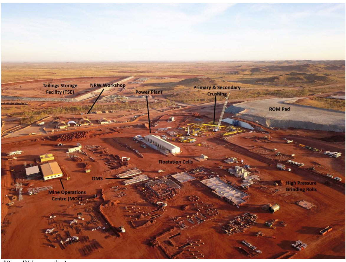
Altura lithium project