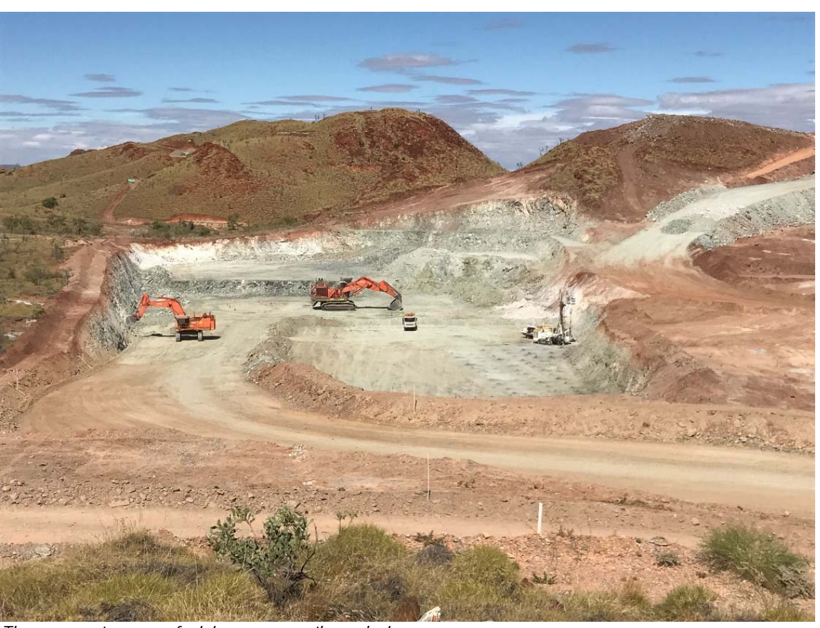
Three separate areas of mining are currently producing ore