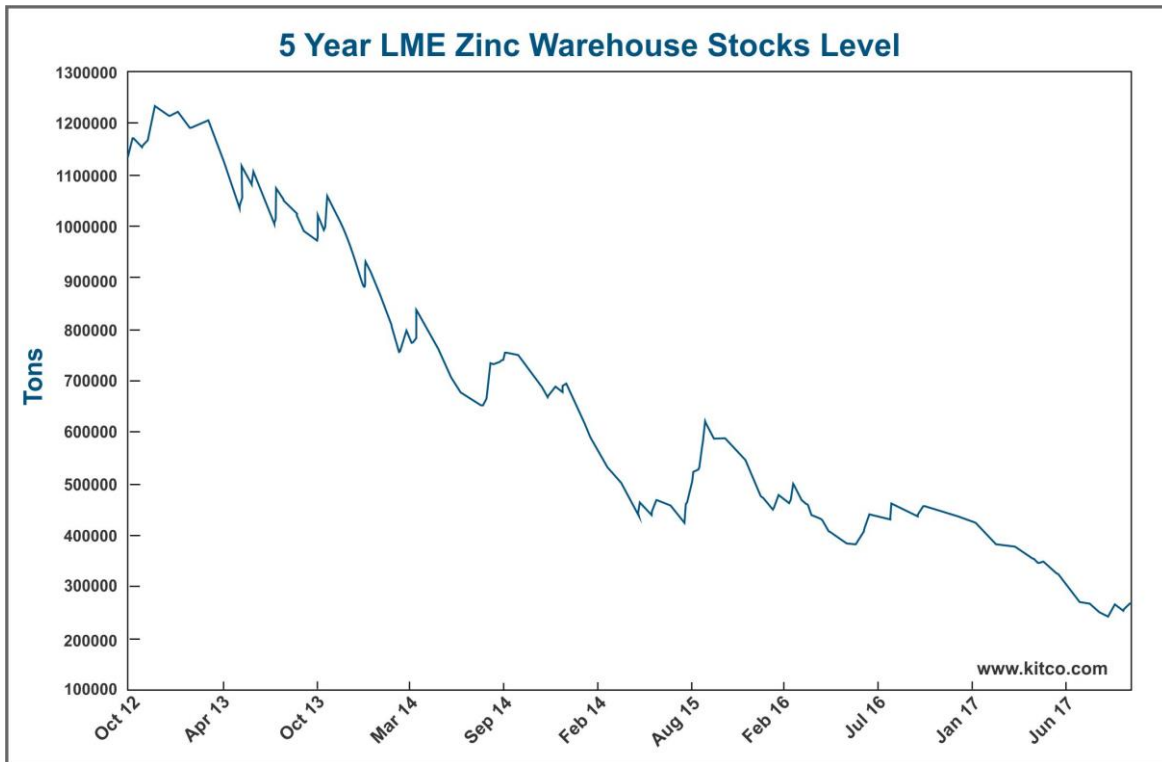
Figure 3: LME Zinc Warehouse Stock Level