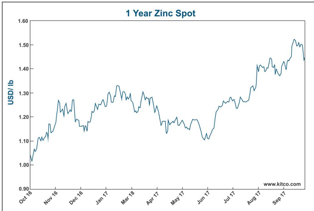
Figure 1: Zinc spot price for 12 months from October 2016

LME zinc stocks are currently below 270,000 tonnes, see Figure 3, which is down by over 40 percent from a year ago, which suggests market tightness. The Chinese Shanghai stockpiles are following the same trend and are also substantially lower. Lower Chinese treatment charges and better zinc payability terms being offered by the smelters also point to a genuine market tightness.