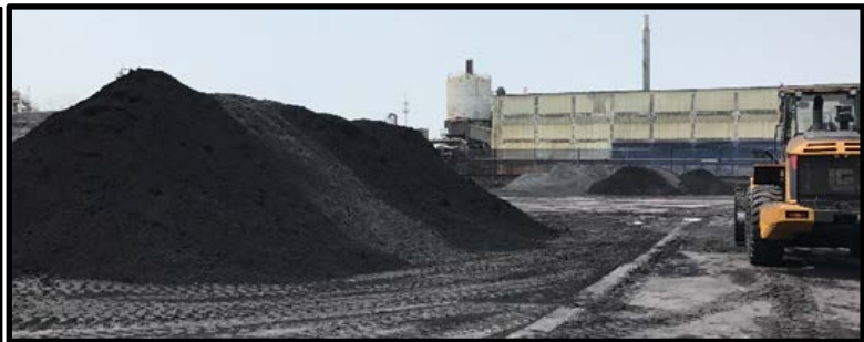
Figures 2 & 3: The 0.5Mtpa Pyrite roasting facility and the iron residue stockpiles at the Jiheng Lantian Chemical Company, in Hebei Province China.