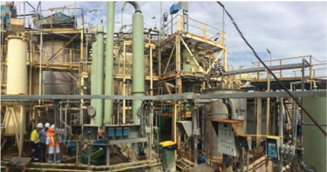
Figure 4: Mirah Gold Mine cyanide recovery resin circuit.

During the Demonstration Plant work Carbine and GRES technical officers were able to visit a successfully operating resin plant being used for the extraction of cyanide as planned for the Mount Morgan Project. The plant is located at the Mirah Gold mine in Indonesia where Green Gold Engineering has installed the resin circuit.