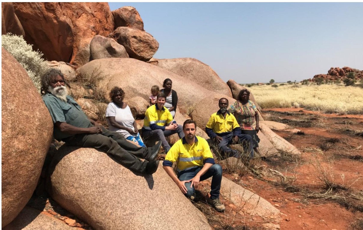
Figure 1. Tjambu Tjambu Cultural Leaders and Agrimin Management

Agrimin Limited (ASX: AMN) (“Agrimin” or “the Company”) announces that it has signed a Native Title Agreement for its Mackay Sulphate of Potash (“SOP”) Project in Western Australia. The agreement was signed at the Kiwirrkurra community on 8 November 2017 by representatives of Agrimin and Tjambu Tjambu (Aboriginal Corporation) RNTBC, the native title registered body corporate for the Kiwirrkurra people (Figure 1).