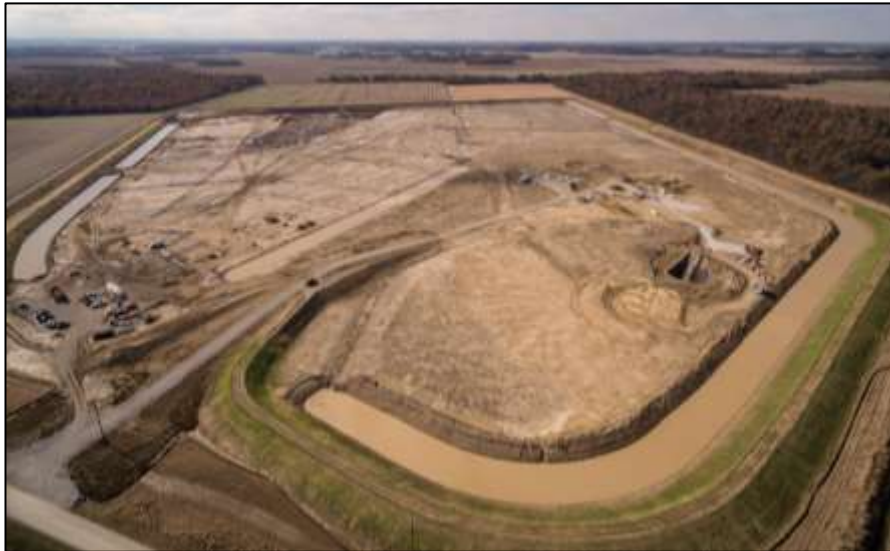
Poplar Grove Mine Site