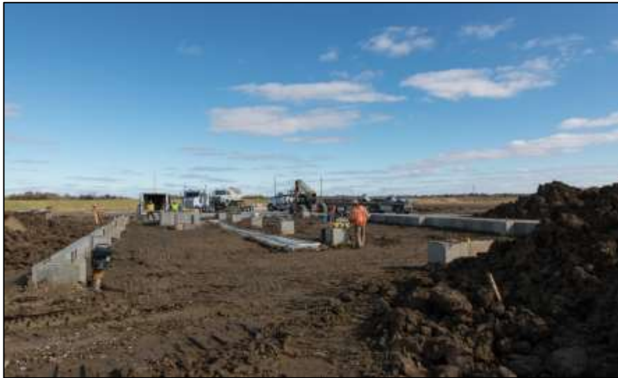
Foundations for the Poplar Grove Mine's CHPP