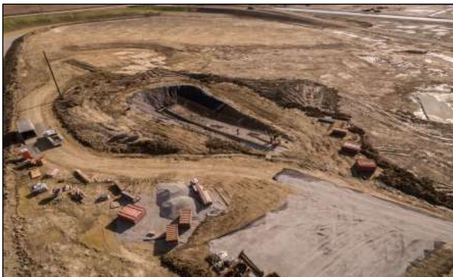
Work Continues at the ROM Coal Reclaim Tunnel