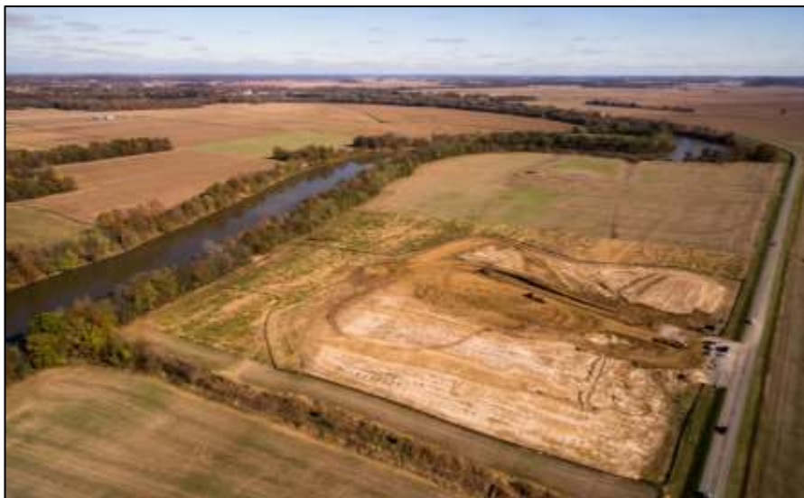
Poplar Grove Barge Load-Out Facility on the Green River