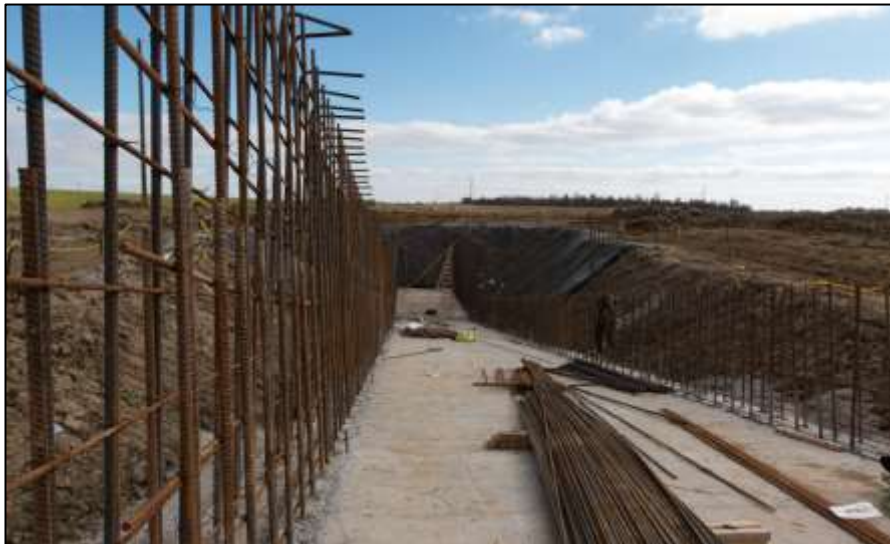
Work Continues at the ROM Coal Reclaim Tunnel