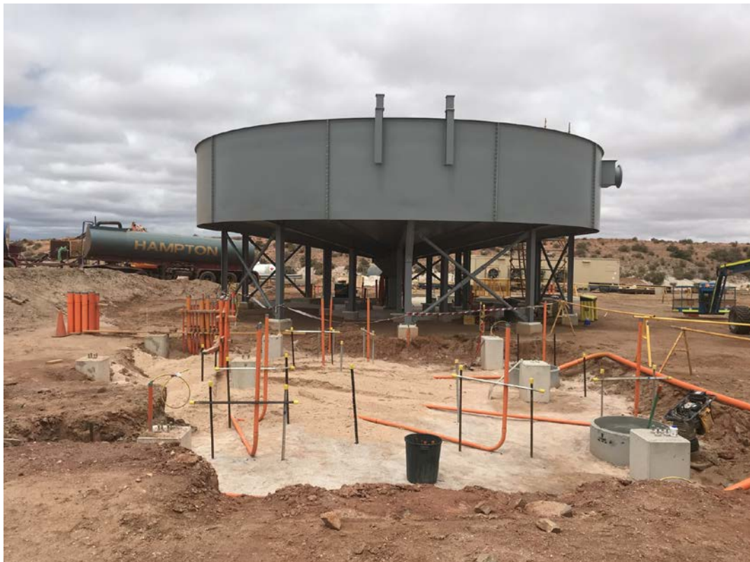
Figure 5 | Thickener