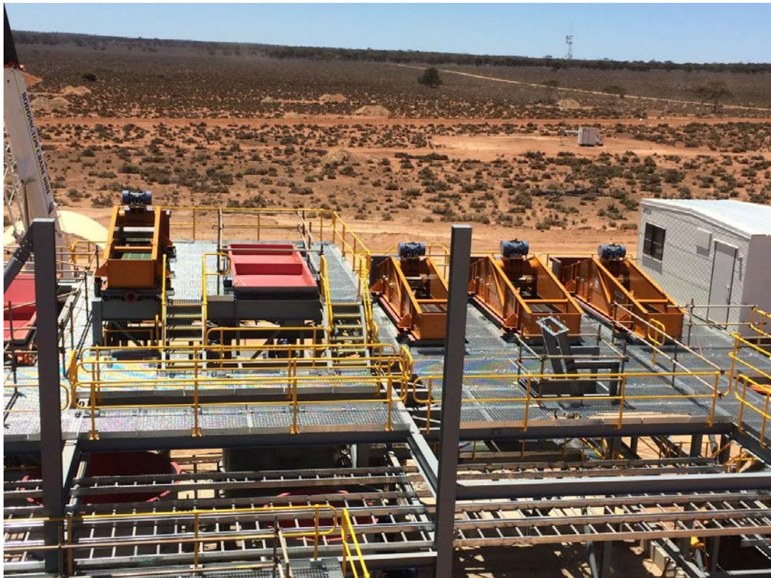
Figure 3 | Underflow hoppers and screen decks being installed