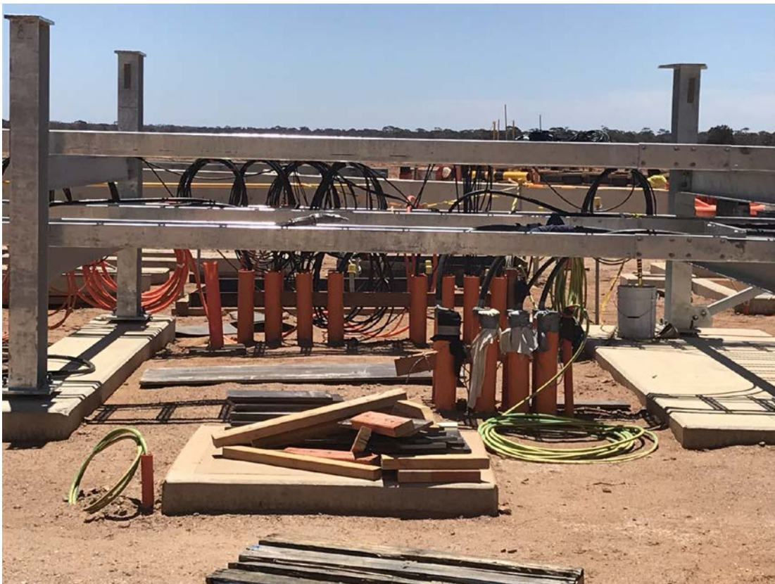
Figure 7 | Electrical Cabling