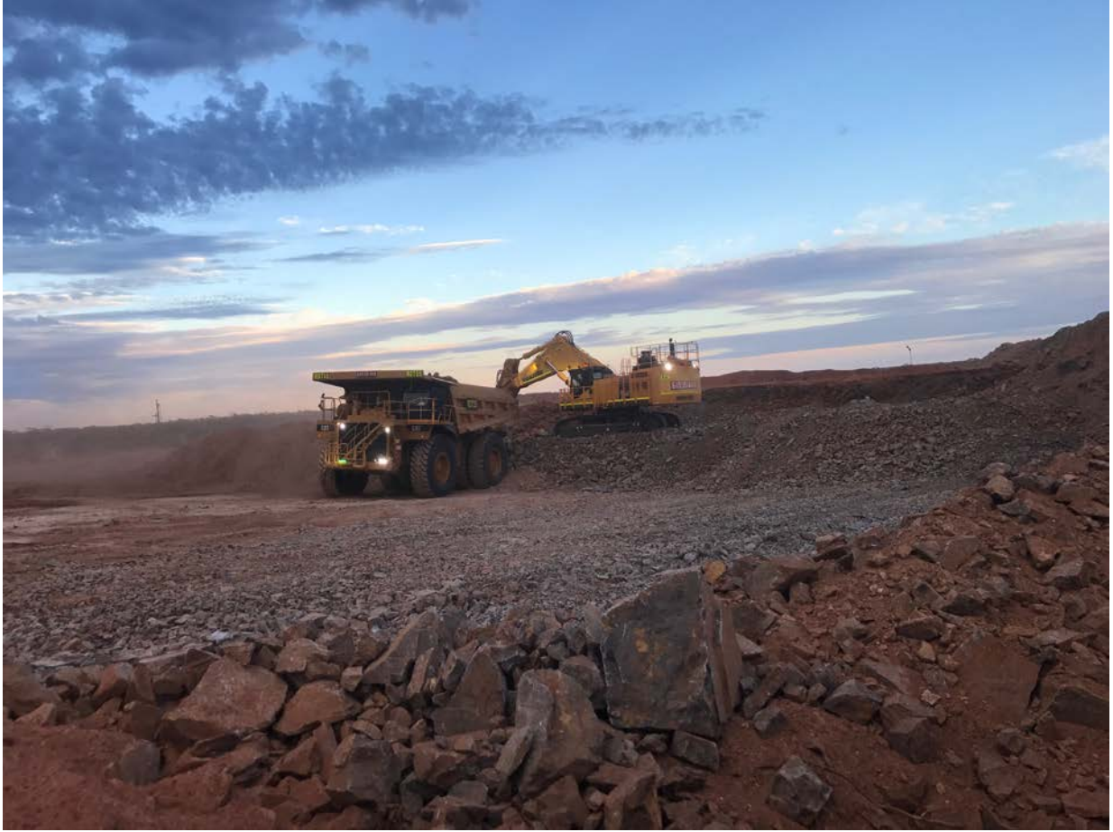
Figure 8 | Removing Waste