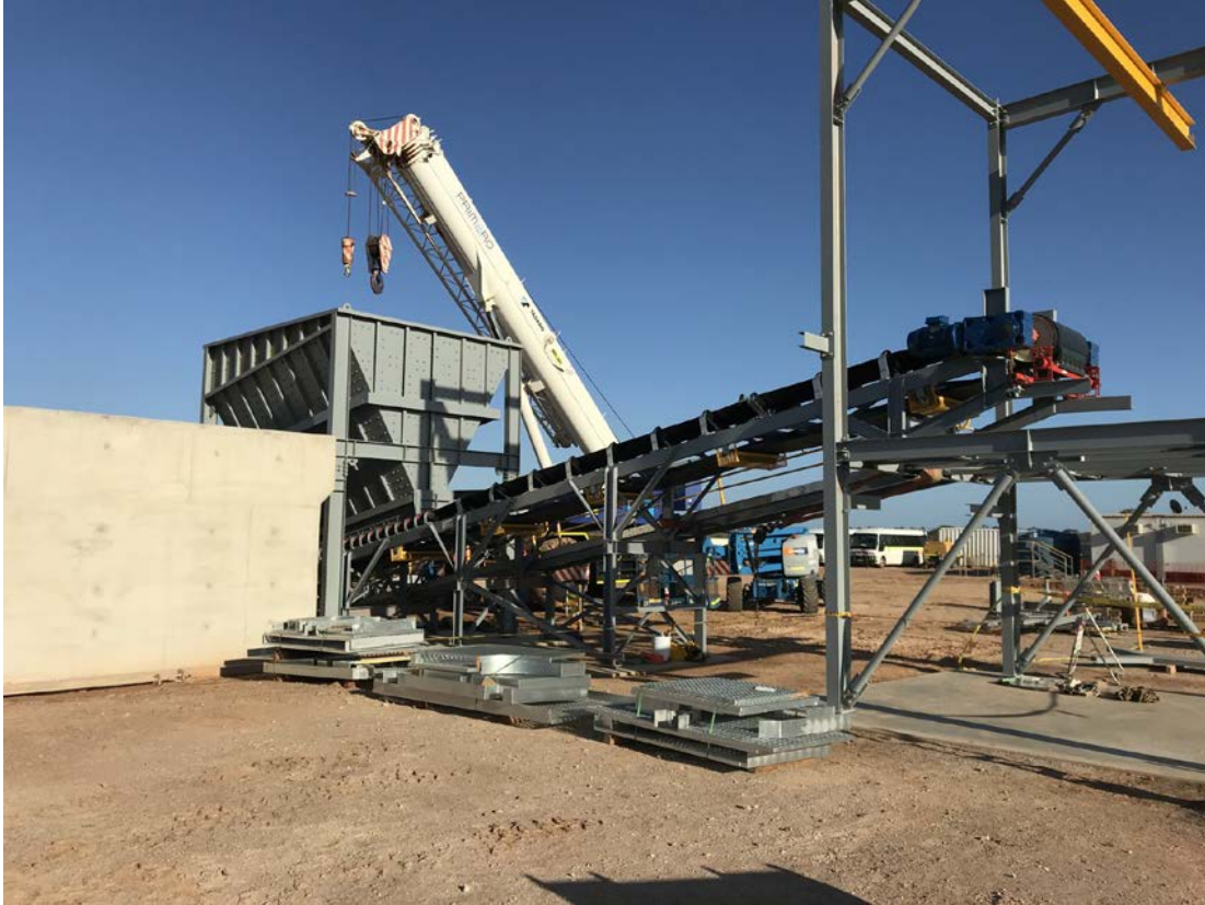
Figure 6 | ROM Feed Bin and Transfer Station