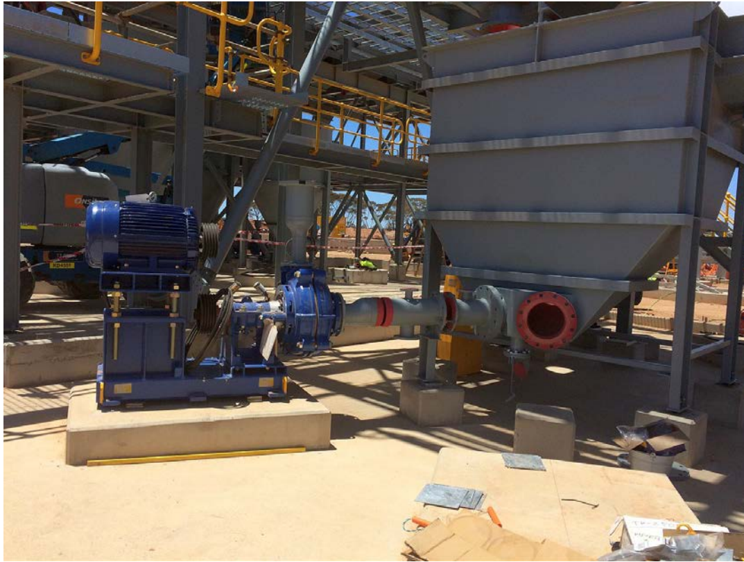
Figure 4 | Pumps being installed