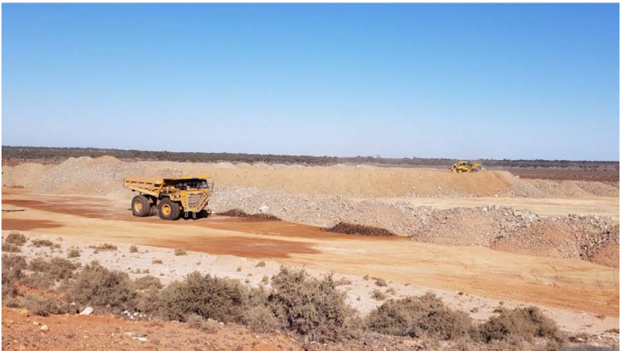
Figure 9 | ROM Pad construction