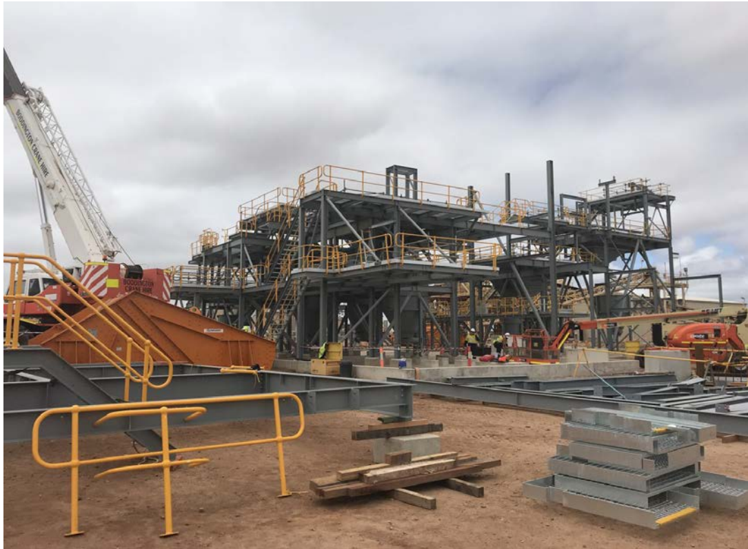
Figure 2 | Structural steel – main DMS building