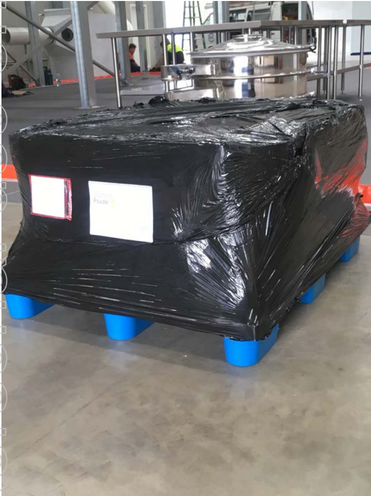
Product Palletised and Ready for Shipment