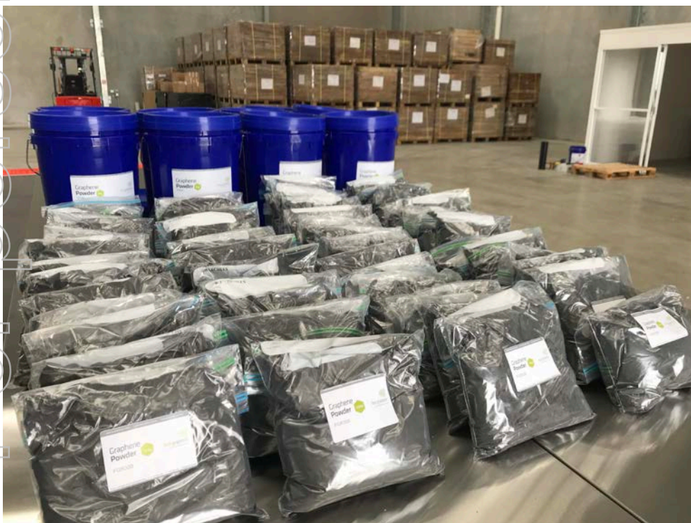
Graphene Product being Prepared for Shipment