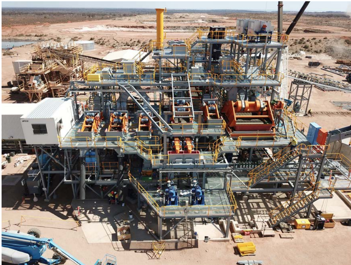
Figure 3 | DMS Plant – December 2017