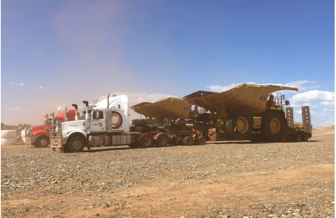
Figure 5 | Arrival of mine trucks – December 2017