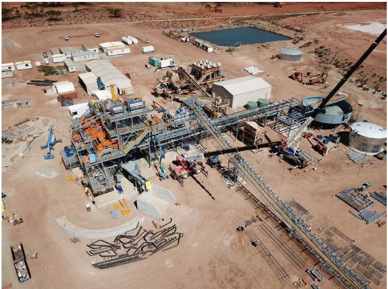
Figure 2 | Plant overview (DMS in foreground) - December 2017