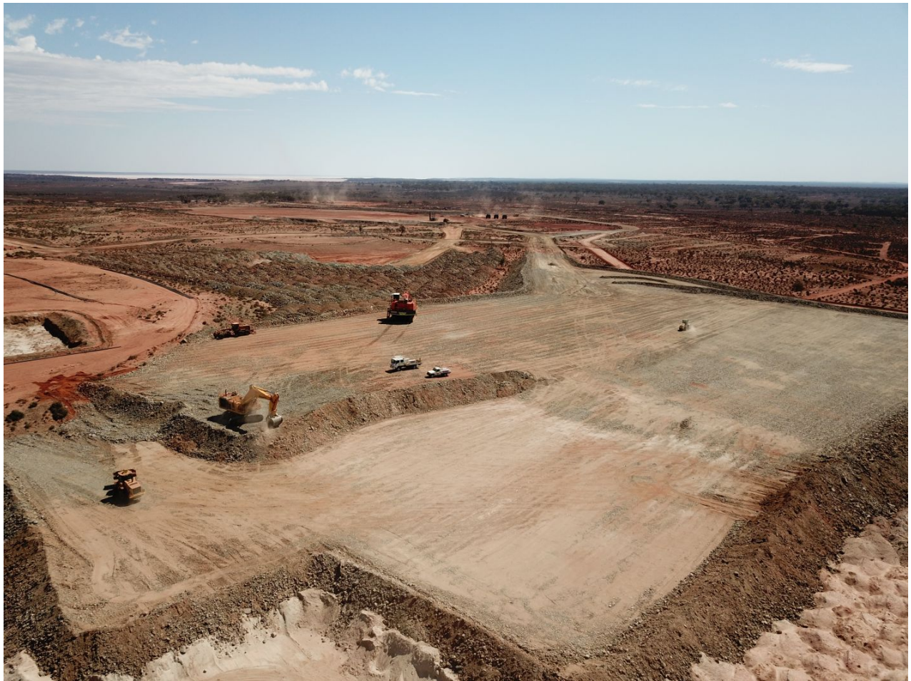
Figure 7 | ROM and crusher pad – December 2017