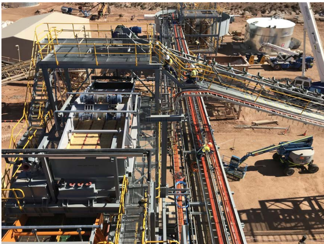
Figure 4 | Piping and Electrical Work – January 2018