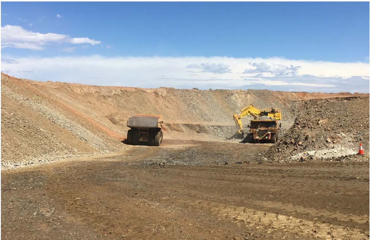
Figure 6 | Truck loading – January 2018