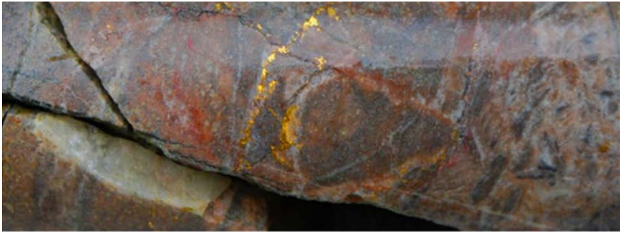
Figure 3: Displaying abundant visible gold in GHDD-111

On delivery of the DFS, Teranga's interest in the joint venture will increase to 70% and they retain the rights to acquire an additional 10% in the joint venture for A$2.5 million. Upon completion of the DFS but prior to a Decision to Mine, Boss may elect to convert the remainder of their interest to a 1.5% Net Smelter Return, otherwise Boss shall be free carried to a decision to mine and will then be required to contribute on a pro rata basis.