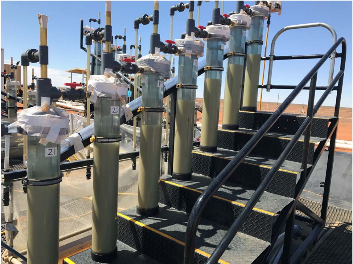
Figure 1: IX Pilot Plant Loading Columns

The IX pilot plant performed exceptionally well, satisfying key technical validation steps during the early commissioning stages on real leach liquor, even when low-grade feed solutions were being treated.