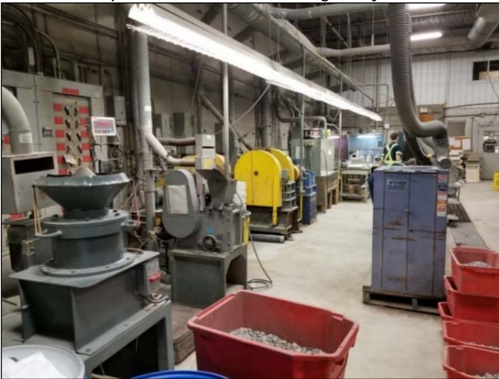
Figure 2: Preparation of the sample prior to pilot testing