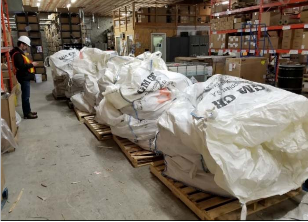
Figure 1: Core sample delivered to the SGS testing facility in Lakefield, Ontario