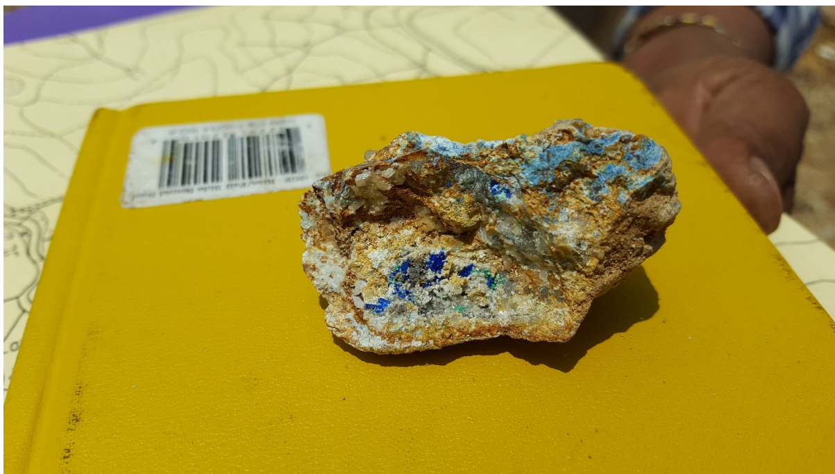
Azurite in hand specimen, ER Valley