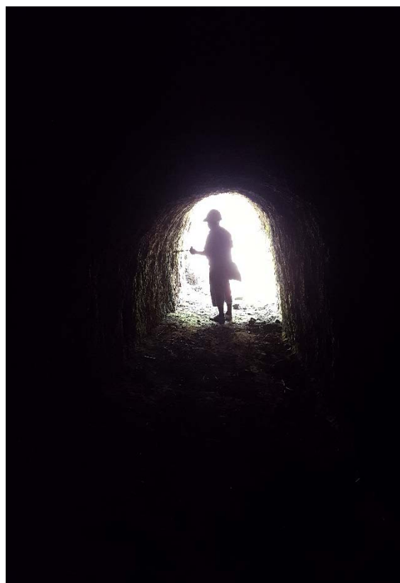
Historical Chinese adits in the ER valley (L) and Gold Hole valley (R)