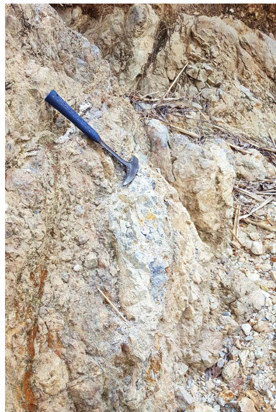
Gossan near the upper Bawdwin village (L) and base metal sulphides exposed in the ER valley (R).

There are a number of high priority exploration targets on the Bawdwin concession which have strong potential for the discovery of new base metals deposits and which require modern systematic exploration programs. These targets include: