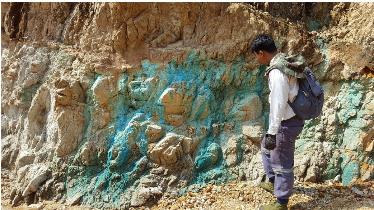
Copper “seep” in the ER valley, approx. 1km southeast of the Bawdwin mine.

“As Bawdwin is a VMS-style deposit, we expect repeated occurrences of wide, high-grade lenses similar to those already known at Bawdwin, to occur along the main controlling structures. The Valentis Exploration Report highlights the considerable exploration upside yet to be investigated at Bawdwin.”