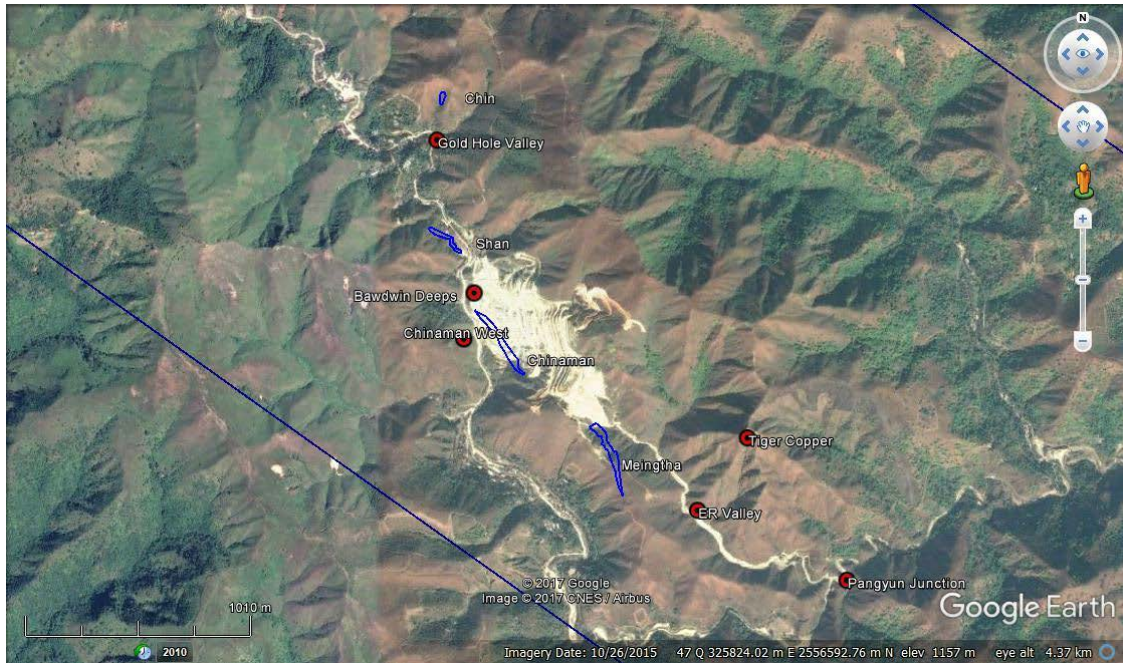
Bawdwin Concession – Location of Exploration Targets.

Several geological mapping programs have been completed at Bawdwin and although the quality of the mapping is generally high, none of this data has been digitally captured for use in vector form, apart from direct scans.