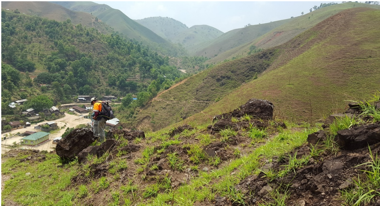
Newly discovered and untested gossan above the upper Bawdwin village.