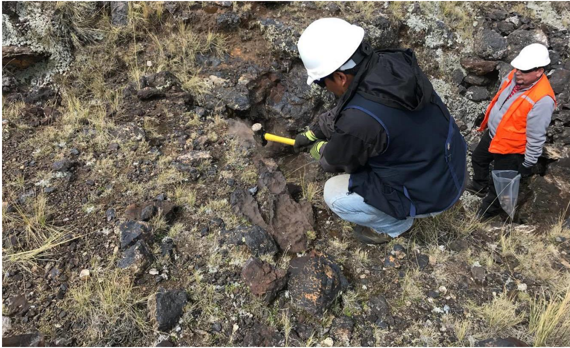
Sampling 1.72% Cu & 158 g/t Ag at Berenguela Central M-035