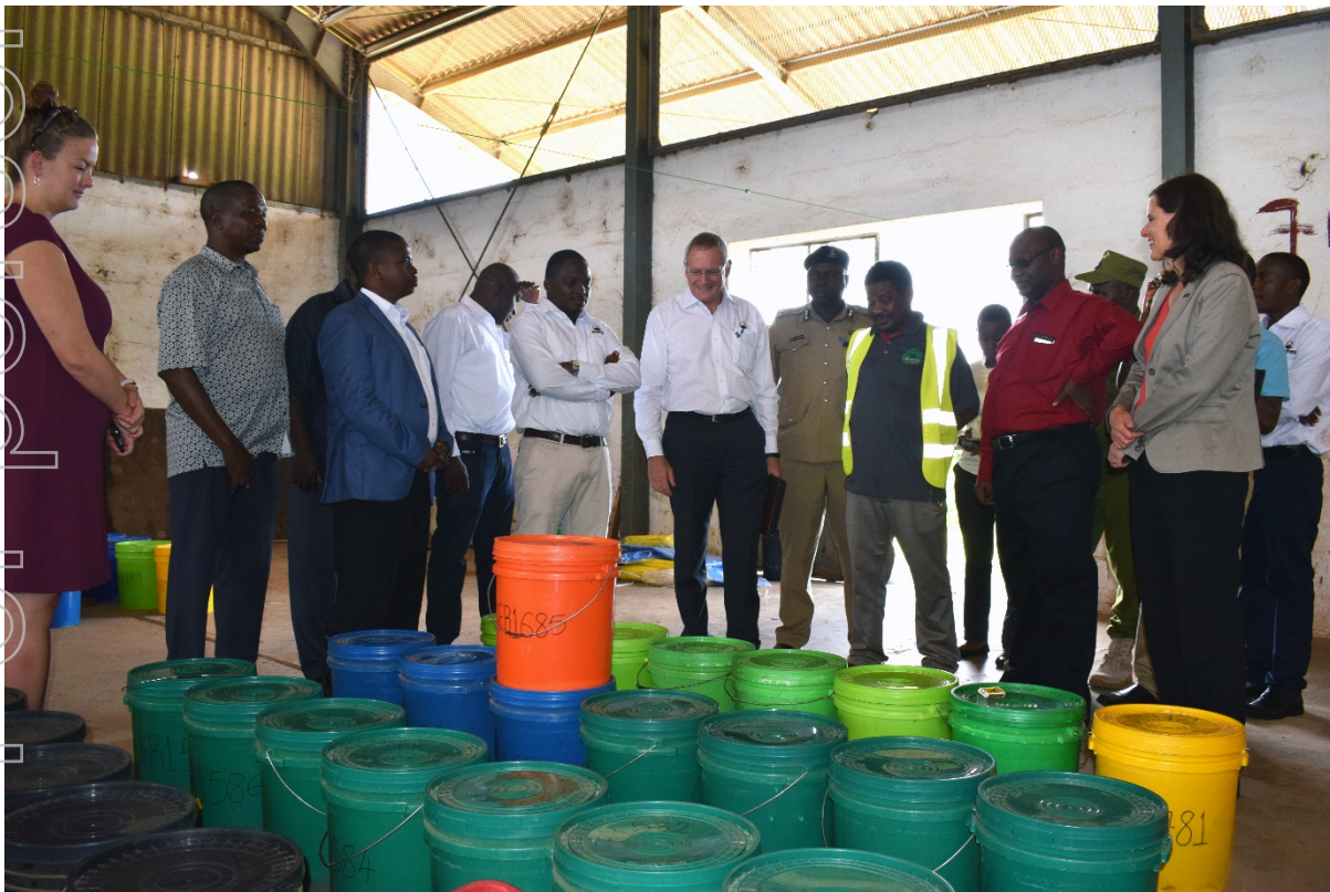
Figure 3 Inspecting composited drill core prior to containerisation.