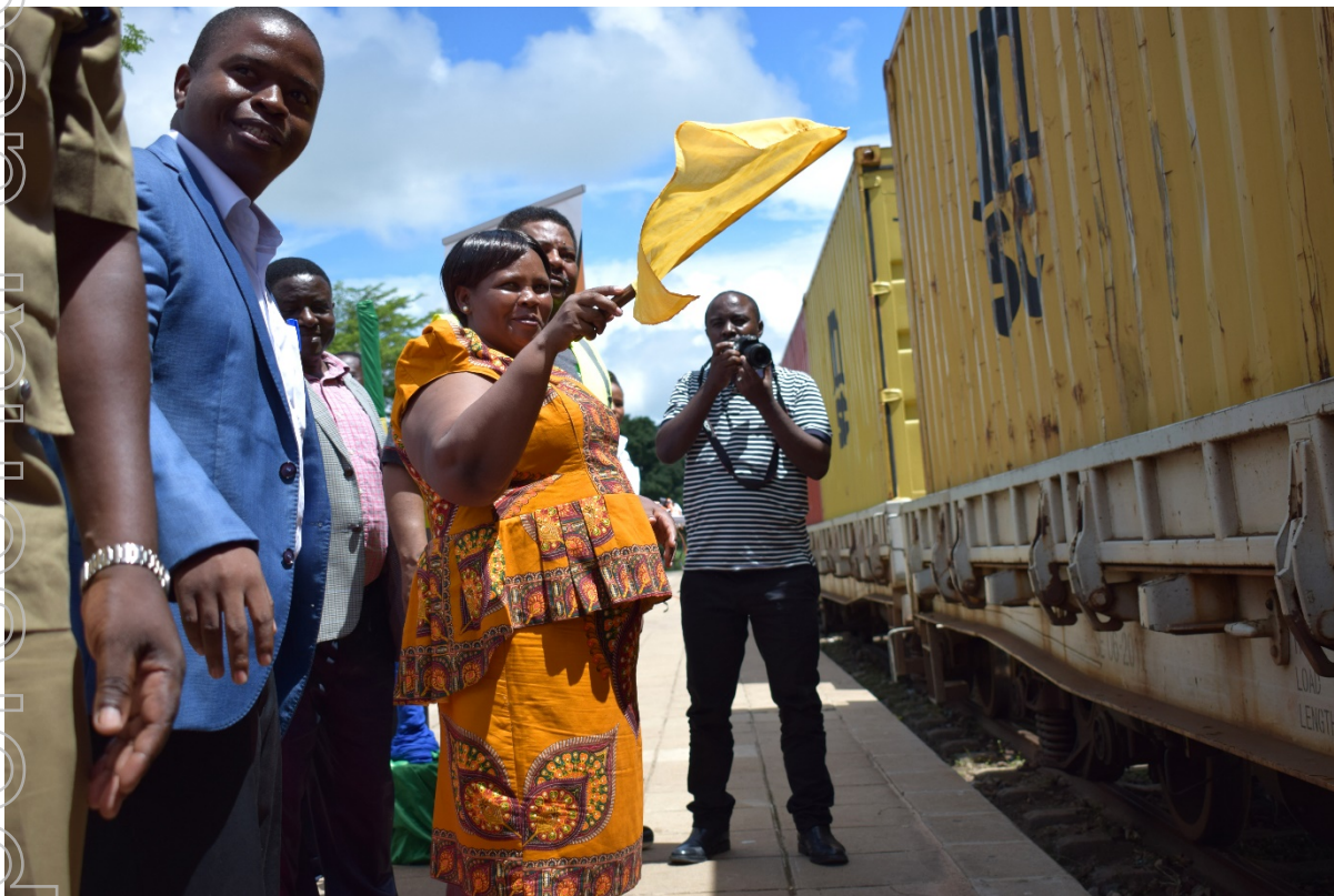
Figure 1 Teresa Ntuke, Commissioner of Mines Morogoro sending off first shipment of Mahenge graphite ore from Ifakara

The recent appointment of the Mining Commission is a significant event. The formation of the Commission creates a pathway for the approval of Mining Licences.”