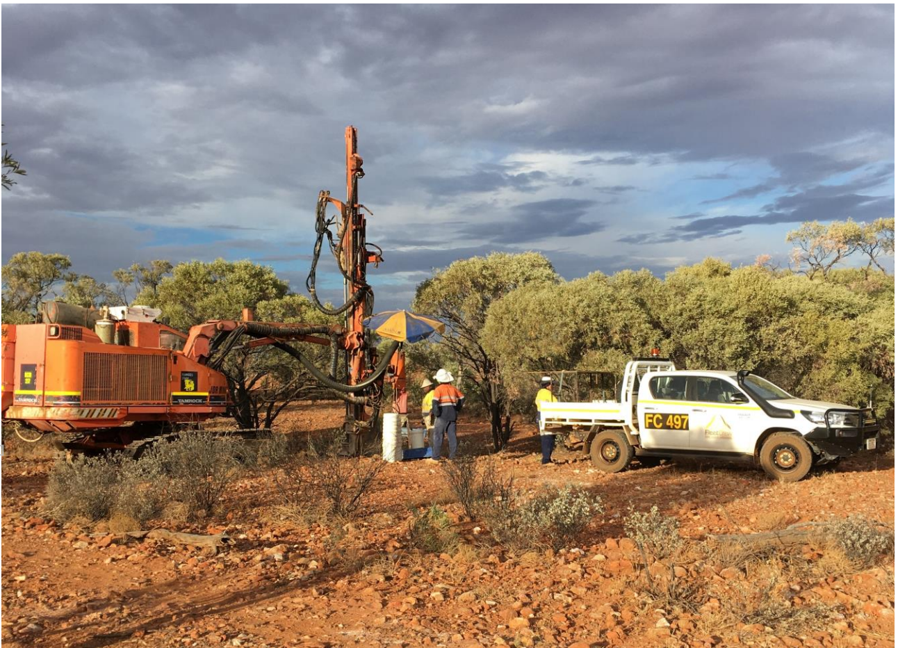
CAPTION: Percussion drilling at Ardmore.

All Drilling Results Received, Resource Estimate Underway