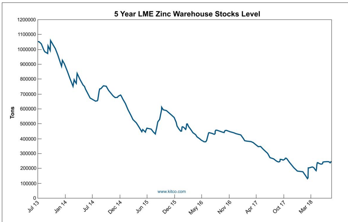
Figure 3: LME Zinc Stockpiles.

The zinc price has continued to hold at a strong price, however there was a pullback of approximately 25% in line with general commodity prices and market volatility with concerns over Global political events. The price appears to have stabilised and global zinc stockpiles hold at relatively low levels meaning tight supply (Figures 3 & 4). At the time of writing the zinc price was ~US$1.20/lb or US$2,644/t.