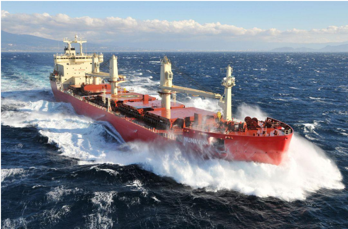
Figure 1: The Nunavik, a PC4 Class Ice Breaker Cargo Ship.