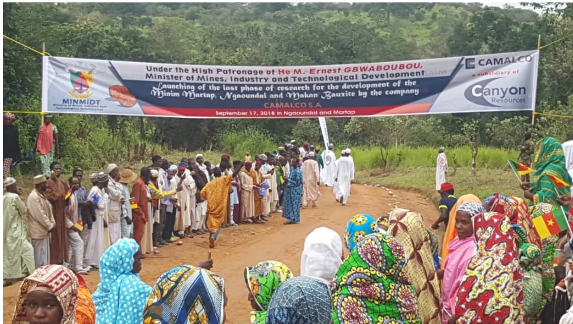
Figure 2: A welcome banner and villagers at the village of Minim

A delegation of Board and management representatives from Canyon Resources, and local senior management from Camalco SA, along with a delegation from the Ministry of Mines, Industry and Technological Development, including His Excellency The Minister of Mines Ernest Gwabouboou and the Governor of the Adamawa Region M. Kildaldi Taguieke Boukar and other local dignitaries, attended the events that were each highlighted by a traditional welcome by the local villagers and speeches from His Excellency, The Minister of Mines and from Canyon Resources Ltd.