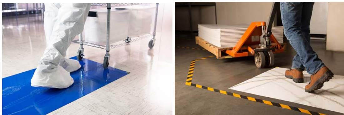
Healthcare and industrial cleanroom employees using Purus BioHybrid mats

PURUS collaborated with SECOS to develop these innovative products. As a key product input, using the BioHybrid™ resin from SECOS, it is anticipated that as product awareness builds sales volume will increase.